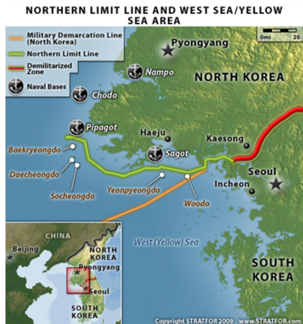
The scene of the two major incidents near the contested Northern Limit Line 2010

As for the Yeongpyeong incident itself, whatever its cause or justification, the fact that North Korea deliberately opened fire on South Korean territory is enough to bring shock and anger. To make matters worse, the incompetence and sloppiness of the South Korean government in its initial response caused uneasiness among the citizens, and its belated displays of toughness and escalation of tension, proclaiming “readiness for a full-scale war,” has added to South Korean people’s sense of insecurity and even stirred their anger.