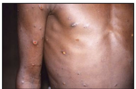
Skin lesions on right arm and torso CDC PHIL ID#: 12779