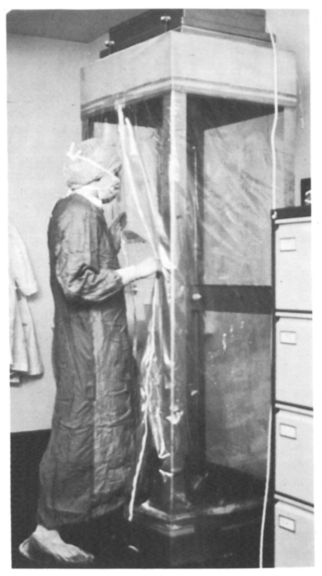
Fig. 2. The 'Body Box' in use.

enclosed the wearer completely from neck to ankles. The suit was made entirely of the fabric with sleeve and ankle stretch cuffs, while the gown was constructed with a front panel and sleeves of GORE-TEX, but the back was made from a continuous filament yarn, textured and woven in a 2 \times 1 twill pattern.