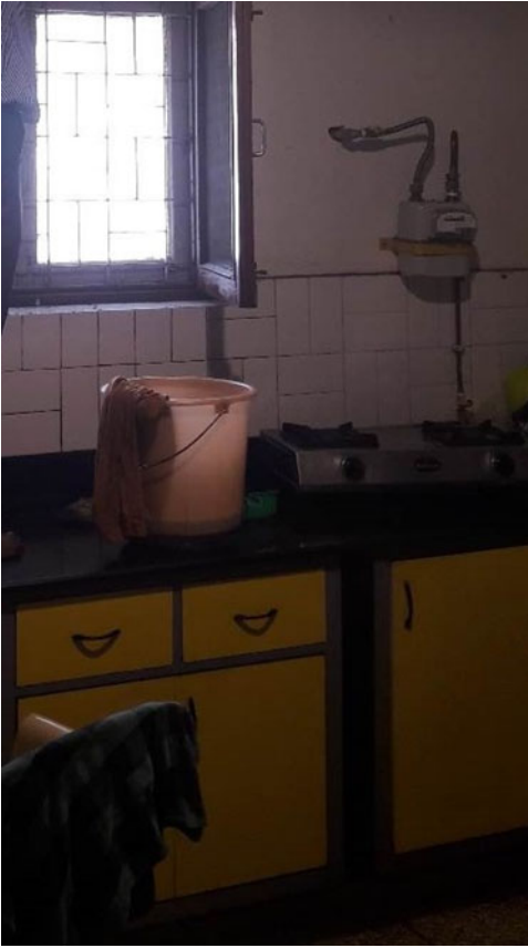
Figure 2. An exemplar of the ‘Good Housekeeping’ course in which the trainer gave instructions on how to clean a kitchen and articulated how ‘the home is our foundation in life’.

Trainer (Question): What would you do if you broke something valuable like a glass?