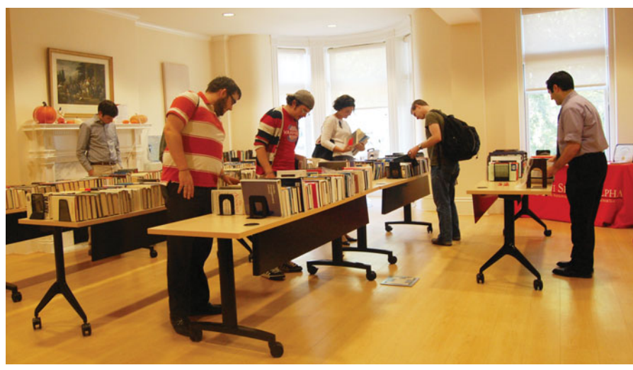
APSA headquarters staff hosted the second annual "Trick- or-Read" event in late October at the APSA offices in Washington, DC. APSA offered a variety of books, old and new, to young professionals and political science graduate and undergraduate students during the day-long open house. In addition to helping grow the professional libraries of these individuals, the event featured reduced student membership rates for on-site applications and festive"treats" throughout the day. The event offered great opportunities to network with APSA's internal political scientists, those in practice here in the metropolitan DC area, as well as other students at various stages. More than 80 people attended. The event was cosponsored by Pi Sigma Alpha.

The Council of European Studies Guide to Institutions Focused on the Study of Europe, 2014 Edition, is now available on IngentaConnect. The Guide is part of the CES Resource Guide series and provides a comprehensive and practical guide to more than 400 European Studies institutions from around the globe.