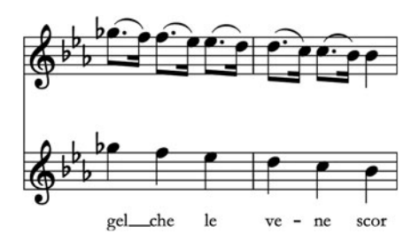
Example 9. K.294, bb.138-9.

the keyboard embellishments, these indicate a kind of written-out rubato and contribute little to the overall expressive scope of each phrase (Example 10b). By contrast, the dynamic embellishments in K.294, which occur during an extended chromatic melisma, show Mozart's vocal writing at its most charged. The passage's expressive force arises not only from the musical content but also from the deep physicality of the performed gestures, particularly the rapid changes to air-speed required in order for the soprano to bring out the dynamic emphases, and which amplify the 'tenero affetto' of the aria's text. As before, such passages show Mozart moving away from the more straightforward conception of virtuosity associated with embellishment, which might manifest itself in the addition of elaborate coloratura passagework, instead exploring expressive devices involving phrasing and tone colour.