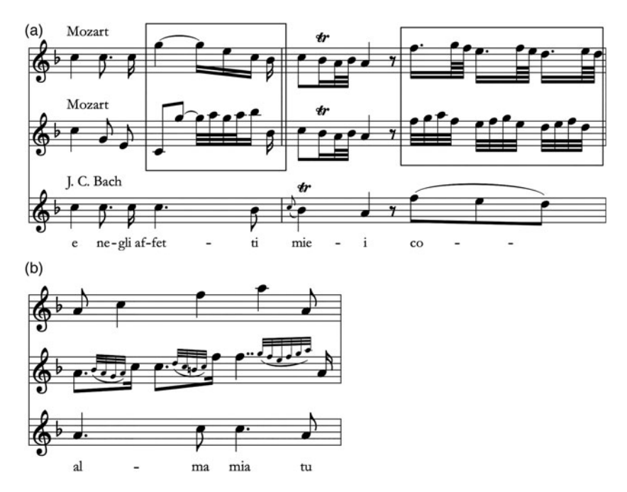
Example 2. Mozart's embellishments for J.C. Bach, 'Cara, la dolce fiamma': a) bb. 33-4; and b) b. 43.