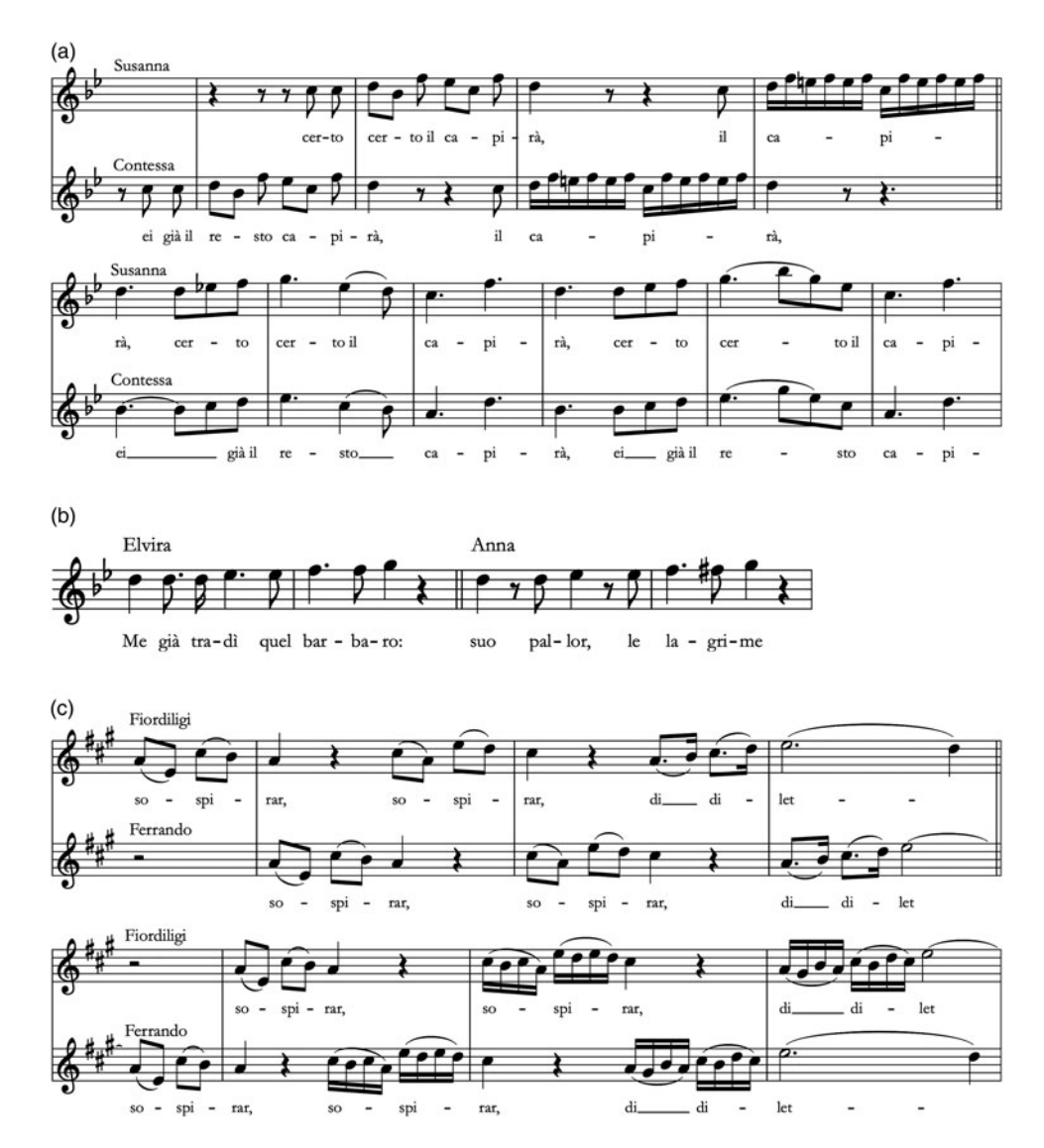
Example 15. Embellishments in Mozart's operatic ensembles: a) Le nozze di Figaro, no. 21, bb. 45–9 and 50–5; b) Don Giovanni, no. 9, bb. 6–7 and 14–15; and c) Così fan tutte, no. 29, bb. 121–4 and 126–9.

phrases (Examples 16b-c). That embellishments of this scope are not included in the original version of Figaro may speak to Mozart's confidence in the first cast. In the case of Storace, this trust was well placed. By all accounts, she was the very personification of a buffa soprano: a skilled actor and supple singer. By contrast, Ferrarese was a 'wooden actor', with limited flexibility and little dramatic imagination.<sup>28</sup> Perhaps the embellishments Mozart included in 'Al desio' were calculated to assist Ferrarese's feeble improvisatory skills. Considering that she also created the role of Fiordiligi, the embellishments in the horn part of the rondò can be understood in a similar light, as providing hints for