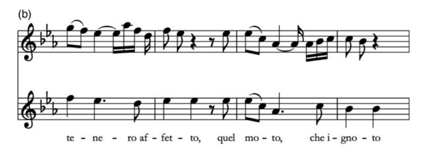
Example 7. Mozart's appoggiaturas: a) 'Ah, se a morir mi chiama', bb. 10-11; and 7b) K.294, bb. 19-22.

themselves in the straightforward alteration of repeated notes on strong prosodic syllables. Although that is sometimes Mozart's strategy, he also accomplishes the same goal using more complex means, such as with elaborate trill or grace-note gestures (Example 7a). In addition, Mozart routinely alters the duration of notes comprising the appoggiatura; thus, a gesture consisting of two crotchets might be embellished as two quavers, or a quaver followed by a crotchet (Example 7b; see also Example 3). Mozart may have expected similar techniques to be used throughout his instrumental concertos, in any passage that explicitly imitates vocal genres. One example is the accompanied recitative-like section in the first movement of the Violin Concerto K.216 (bars 147–51), in which the insertion of appoggiaturas should most likely involve not only the alteration of pitches but also some rhythmic adjustment. As with the issue of doubled melodies discussed earlier, this is a straightforward case in which the practical questions facing performers of Mozart's instrumental works can be answered by considering his operatic embellishment models.