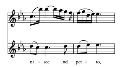
Example 6. K.294, bb. 53-4.

accompaniment. In one embellishment in K.294, the original melody (doubled by violins and bassoon) sustains a C, while the embellished variant holds a Bb one seventh higher (Example 6). Although the doubling of melodies between soloist and orchestra is rarer in Mozart's piano concertos, it does occur – for instance, throughout the slow movements of K.488 and K.491 – and the extent of the divergences in his arias suggests that similar passages in his instrumental output are also more tolerant to embellishment than has been assumed by modern-day performers.