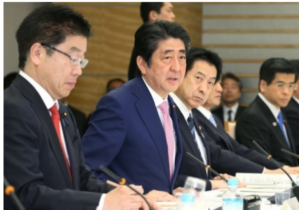
Prime Minister Abe addressing the Council for the Realization of Work Style Reform

treatment of workers. This is largely because the policymaking process continues to be dominated by business leaders and by conservative government officials strongly opposed to enhanced regulation and worker involvement in governance processes. The result is that the reforms on the two key policies head in totally different directions. The proposed reform of work hours would deregulate rather than tighten the current rules, which are already ridiculously slack. In contrast, the equal work for equal pay proposal eschews the job evaluation processes successfully utilized to promote fair compensation in other countries in favor of employers' subjective evaluation, based on the concept of "balanced treatment," that is more likely to increase inequality than alleviate it.