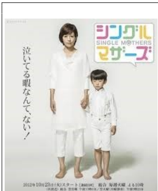
Advertisement for a television program

In practice, the Work Style Reform agenda essentially continues the strong push for employer-friendly reform made by Abe since the beginning of his prime ministership, with the usual re-marketing and a bit of reorientation. As seen in the table below, the agenda consists of nine items with the potential to greatly change employment practices in Japan; none are truly new, but the Abe Government has arguably pressed them harder than previous administrations. At least two other important reforms demanded by the LDP's backers in the employer community, kinsen-teki kaiketsu (monetary resolution, a scheme to enable companies to dismiss regular workers upon payment of severance) and expanded use of gentei seishain (limited regular employee, intended to be a an employment status midway between regular and non-regular employee), are not on the list, even though they are being intensively pursued