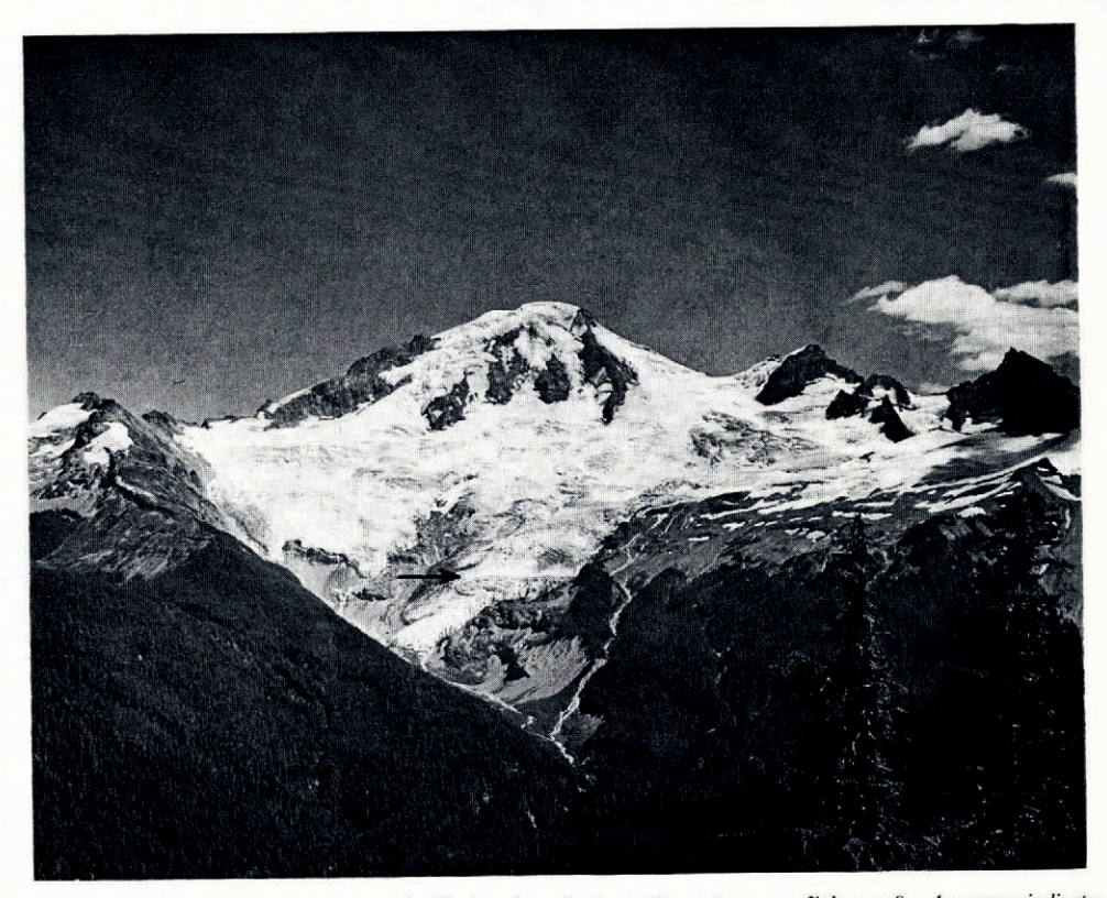
Fig. 1. Mt Baker and Coleman and Roosevelt Glaciers from Lookout Mountain on 27 July 1958. An arrow indicates the location of the brink of the lower Coleman ice fall.