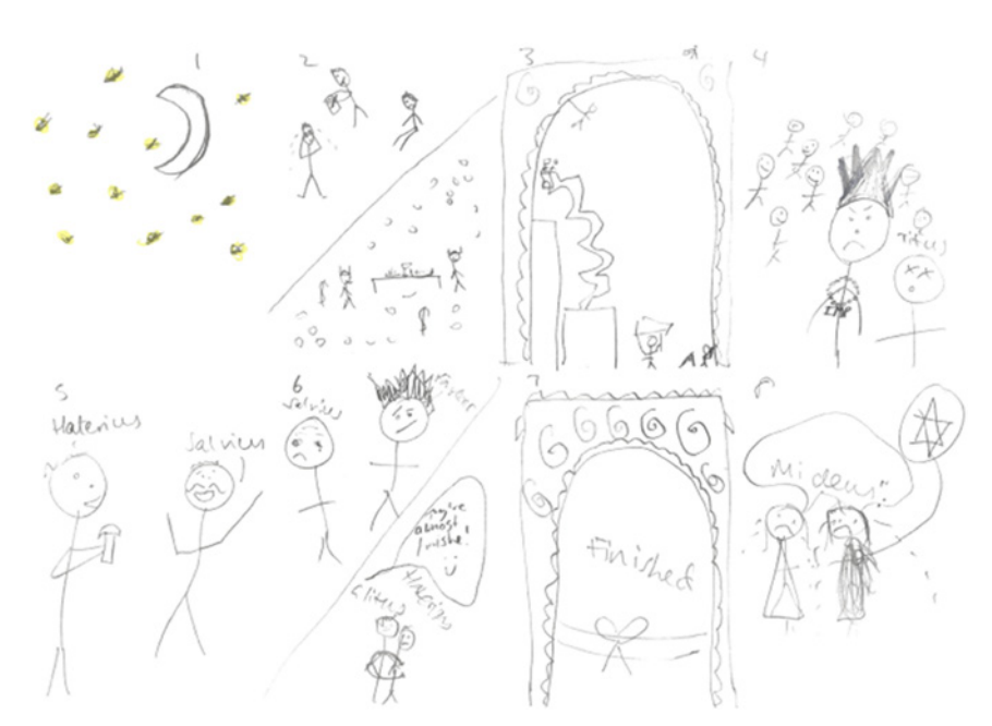
Figure 3. | Sample of student's visualisation of the narrative.

Figure 2. | Sample of student's annotations of text.