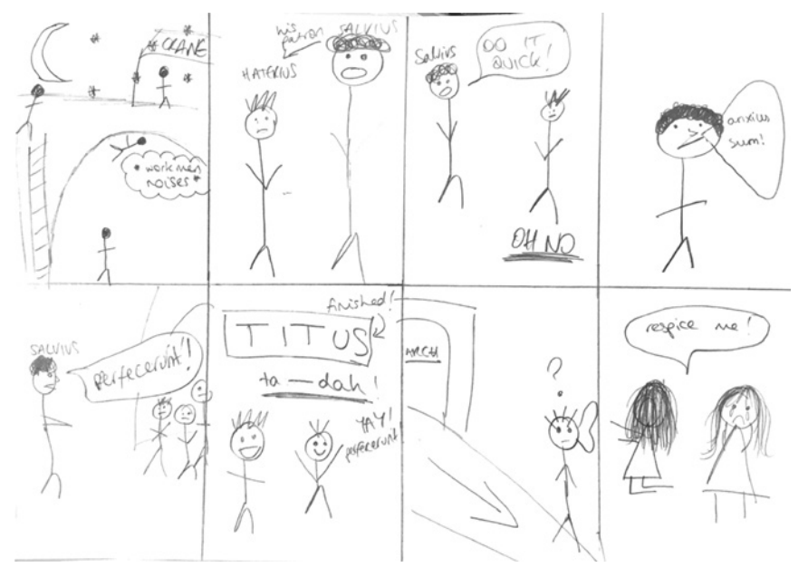
Figure 5. | Sample of student's storyboard of the narrative.

set texts. Rachel remarked that she 'didn't enjoy the annotation work, it was complex'. This student is one who is a strong reader anyway, and so perhaps found the microscopic lens slowed her down. It is hoped, perhaps,