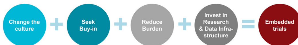
Figure 1. Improvements for overcoming barriers to conducting embedded trials.

EHR, electronic health record; NIDDK, National Institute of Diabetes and Digestive and Kidney Diseases; NIH, National Institutes of Health.