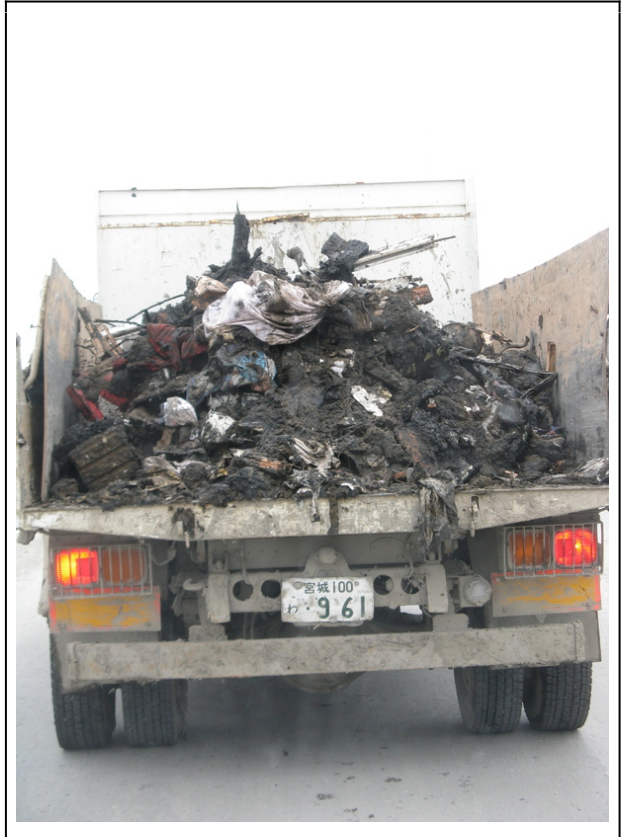
A truck hauls debris and sludge deposited by the tsunami to a temporary dump site. Because much of the sludge has already been moved from its original location, identifying that which came from potentially-contaminated sites is a challenge.

For a city like Ishinomaki, where paper, fertilizer, feed, and chemical factories are located directly adjacent to the shore, near homes and schools, and over six million metric tons of debris washed up<sup>28</sup>, the giant wall of water destroyed conventional boundaries between "safe" and "hazardous." No one knows if oil and chemicals spilled in one place stayed put, washed out to sea, or ended up in another part of town.