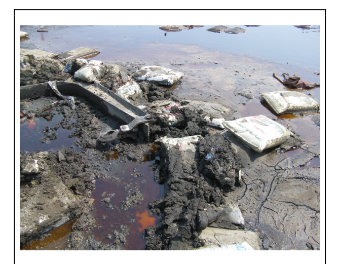
Bags of fertilizer lie strewn about the grounds of a factory in Ishinomaki, Miyagi Prefecture, 10 April 2011.

expert Yoshinobu Kitamura, who is serving on a prefectural disaster waste committee in Iwate. "The first priority [for prefectural officials] is to clean stuff up and keep transport routes open. Sure, the government expects contamination, but attention to chemicals is a low priority right now." Harried prefectural and municipal officials echoed that explanation.