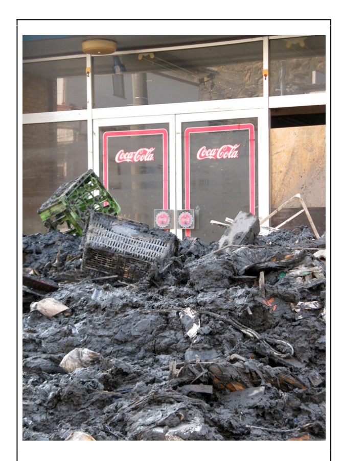
Tsunami sludge blocks the doors of a shop in Ishinomaki, Miyagi Prefecture, 10 April 2011.