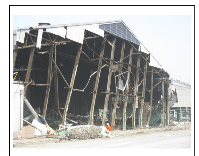
A worker takes a break from cleaning up a decimated plywood factory on the wharf in Ishinomaki, Miyagi Prefecture

Dozens of high-tech and automotive production facilities also sustained damage from the quake and tsunami. Companies with plants located in Tohoku include Canon, Elpida, Fujitsu, Hitachi, Honda, Kyocera, Nissan, Panasonic, Texas Instruments (which described "substantial damage" to its semiconductor plant in Miho that affected gas, air, and chemical delivery systems), and Sony. 15 Reports posted on company websites or noted in industry publications summarized damage very generally and primarily in terms of impact to business and production capacity. One exception is the bulletin from Freescale on its semiconductor plant in Sendai, which suffered serious damage. The company reported that when "personnel first reentered the fab [in late March] . . . they found broken ducts, pipes and windows and discovered that chemicals had leaked."16 Online industry publication Medicine Hot News reported damage at seven major pharmaceutical companies in the Tohoku region.<sup>17</sup>