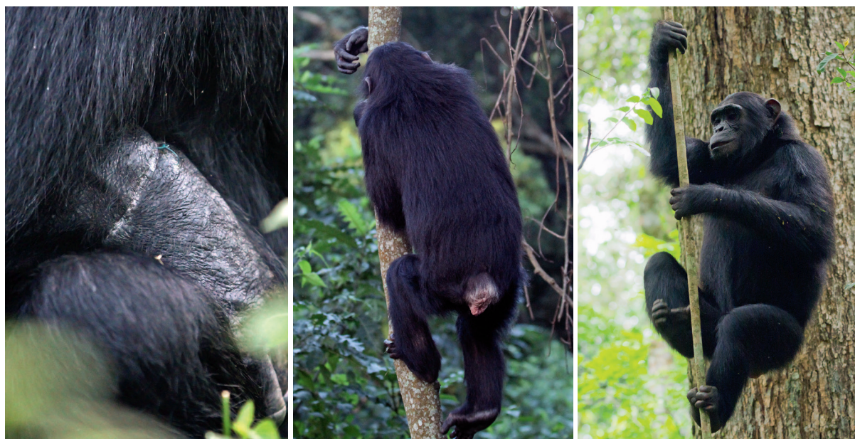
Special two months after intervention (left and middle) and gripping a branch three months after intervention (right).