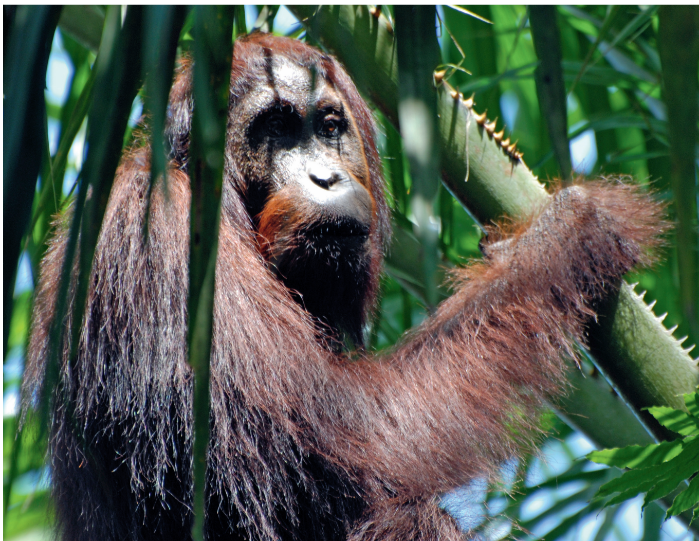
Photo: When species conservation goals conflict with the interests of human individuals and collectives, they can generate difficult moral dilemmas whose resolution requires careful consideration and respect. Orangutan in an oil palm plantation.

of interspecies interdependence, attuned to the flourishing of both humans and animals as members of their ecological communities (Batavia et al. , 2021; Kirby, Steindl and Doty, 2017; Nieuwland, 2020).