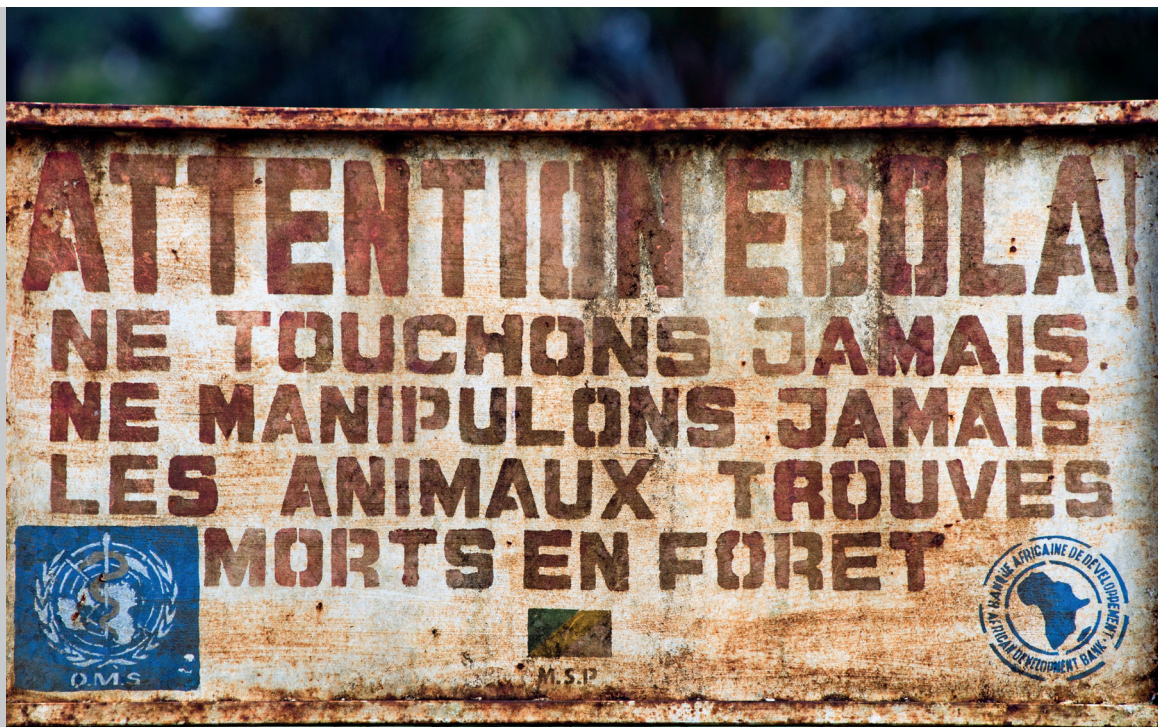
Photo: Is it justifiable to spend significant resources on a potentially unachievable goal of protecting apes against Ebola virus disease (or another threat to their health) in situ while the health needs of neighboring human communities remain unmet due to a lack of funds?

60 mountain gorillas ( Gorilla beringei beringei ) to protect them against what they presumed was measles, although the diagnosis remained unconfirmed (Cranfield and Minnis, 2007).