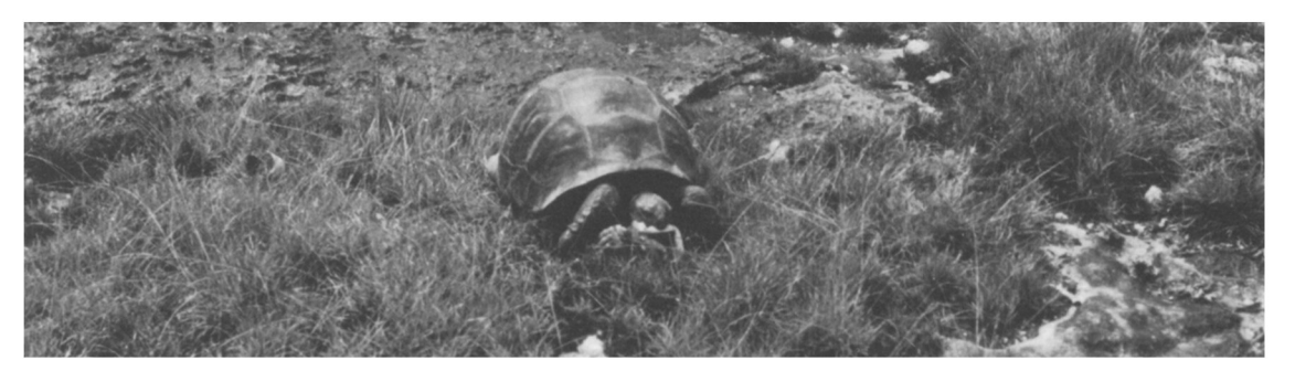
A giant tortoise safe on Aldabra, unlike those on Curieuse.

Warden reported that he had found a tortoise with severe knife or machete wounds in both legs and mutilated skeletons had been found in the sea. In the course of his normal duties the Warden is absent from the island for up to three months at a time, so the tortoises are unprotected for long periods.