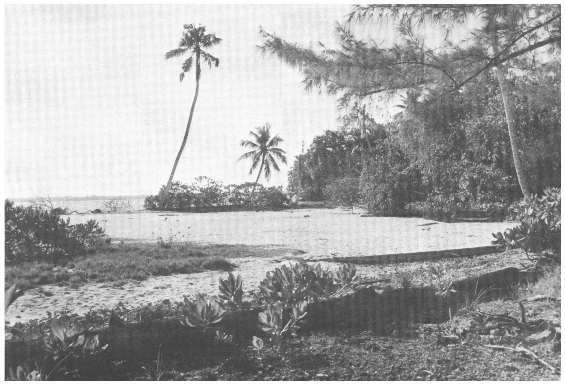
A lagoon-shore inlet in Diego Garcia, Chagos Archipelago, British Indian Ocean Territory. This dependency contains the largest expanse of undisturbed reefs in the Indian Ocean.