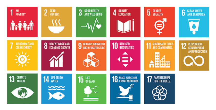
FIGURE 20.1 The UN's Sustainable Development Goals

movement is the most recent global attempt to move in the opposite direction from the steady-state and degrowth economy movements.