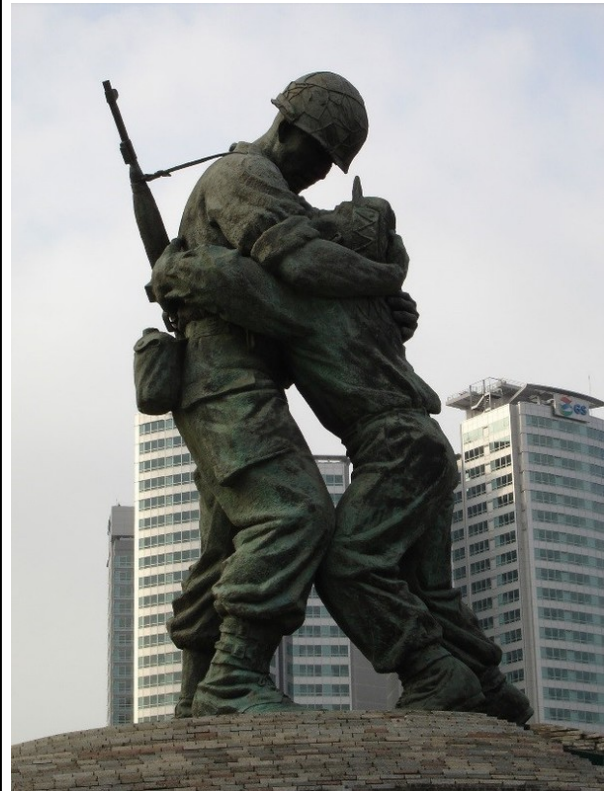
Monument in front of the Korean War museum in Seoul: Two brothers meet on the battlefield. Note the obviously hierarchic relationship between the armed South Korean (left) and the unarmed and much smaller North Korean (right). 2

On February 10, 2016, the South Korean government announced that it would close the Kaesŏng Industrial Zone (KIZ) in response to the North Korean nuclear test of January 6 th and the launch of a satellite on February 7 th . The zone, sometimes simply called by the name of the adjacent city of Kaesŏng, had been the last tangible outcome of the historic first inter-Korean summit of June 2000, which later that year had earned one of its two participants, the South Korean president Kim Dae-jung, the Nobel Peace Prize. His counterpart Kim Jong-il, who hosted the summit, received none. He was compensated generously by what has been rumored to be millions of dollars from South Korea. The payment was allegedly facilitated by Hyundai. 1 That is the same company that managed the Mt. Kŭmgang tourism project in North Korea, another successful joint project that has been frozen since 2008. Through its subsidiary Asan, Hyundai also built the Kaesŏng industrial zone.