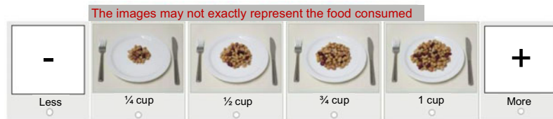
Figure 1. Question example (translated from the original French questionnaire).

On average, how many cooked legumes did you eat each time?