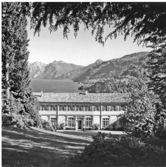
Figure 5.1 View of Villa Serbelloni, part of the Rockefeller Foundation property in Bellagio, Italy, where administrators gathered for successive meetings that gave rise to CGIAR, undated.

about civil unrest in Pakistan and India reached the United States. 2 This narrative intends to highlight a profound irony of the Green Revolution. Although agricultural interventions had the goal of containing social unrest in the developing countries by filling peasants' hungry stomachs and thereby closing their ears to the siren song of communism in the global Cold War, their actual fallout was further unrest. In contrast to this reading, I show in this chapter that the experts of the Green Revolution were at least as excited about new opportunities for interventions arising in the social fallout of their supposed triumph as they were haunted by these same patterns. Now that the stomachs had been filled and expectations had been raised, "second-generation development problems" beckoned to be tackled.