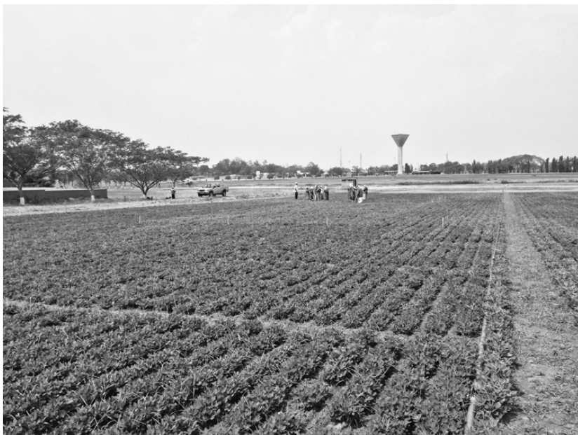
Figure 5.2 Day laborers work in an experimental peanut field at ICRISAT's Hyderabad campus, 2016.

marketing, distribution and transport systems for exports of raw materials and commodities from developing countries. 54