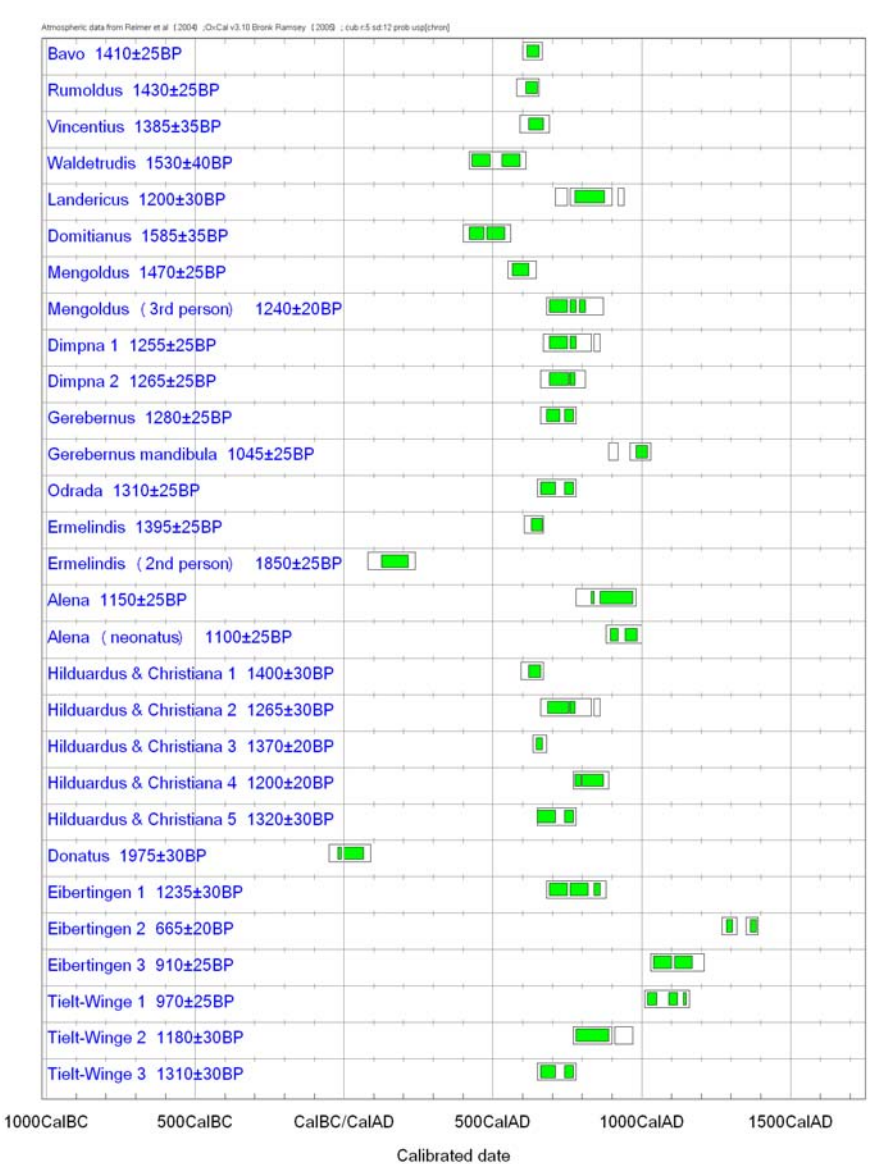
Figure 2 Calibrated <sup>14</sup>C ages from skeletal material from Belgian saints

and Georges 1982). Documents other than his vita endorse the existence of Domitianus. This, however, is not the case for Mengoldus. The relics ascribed to Domitianus represent a single skeleton, but the collection of bones supposed to have belonged to Mengoldus contains elements of a third individual. <sup>14</sup>C dates place the remains of Domitianus in the 5th or the first half of the 6th century AD, while the bones of the skeleton believed to represent Mengoldus date back to the second half of the 6th or the first half of the 7th century AD. The admixture of bones to this last skeleton gave a broad dating from the end of the 7th to the late 9th century AD. The second relic thus presents problems in terms of authenticity, although it is still an early medieval artifact.