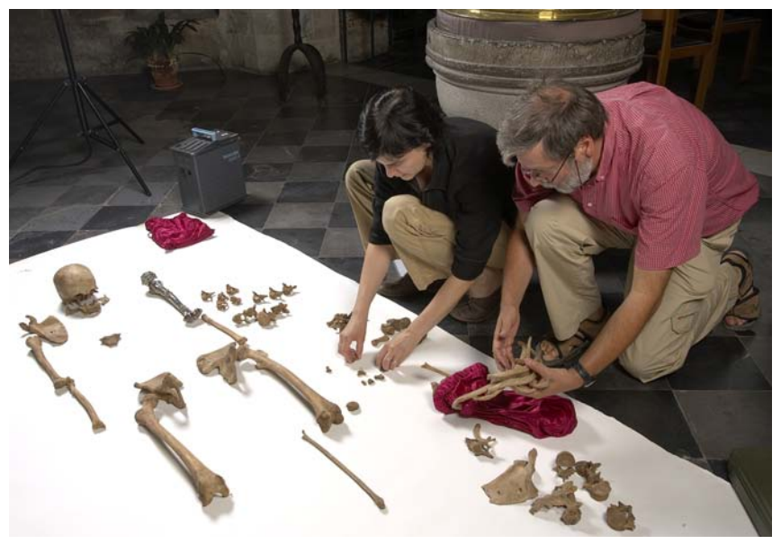
Figure 1 Reconstruction of the skeleton of Alena

It should be noted that this project focused upon the skeletal remains of so-called "local" saints. These are saints that have or had only a limited regional impact and that were only worshiped in a geographically very restricted area. Some of the saints represent people whose existence has been attested by reliable historical sources, while others clearly are legendary figures (Figure 1).