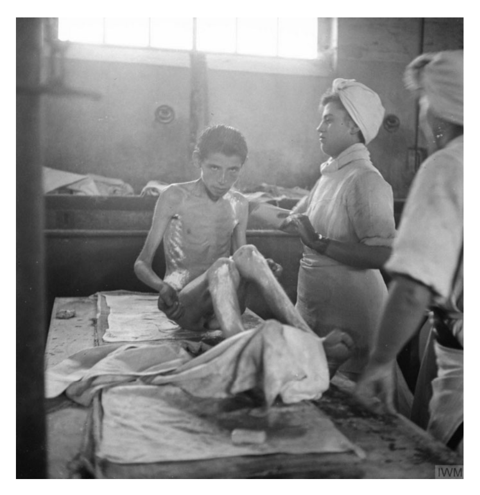
Figure 3. Delousing in Belsen, May 1945. An emaciated male survivor being dusted by German nurses employed by the British Army.

a camp in Austria as memorable for its strangeness but otherwise unremarkable. "Everybody accommodated himself to the treatment," Levi writes, "swearing or laughing from the tickling," save for an Italian naval officer who, when "chaste but rough" American hands moved to dust his fiancée, "placed himself decisively in between." For Levi, the procedure was principally significant as the moment of "purification and exorcism" in which "the West took possession of us....[I]t was easy to perceive behind the concrete and literal aspect a great symbolic sideshow, the unconscious desire of the new authorities, who absorbed us...to strip us of the vestiges of our former life, to make of us new men consistent with their own models, to impose their brand upon us."