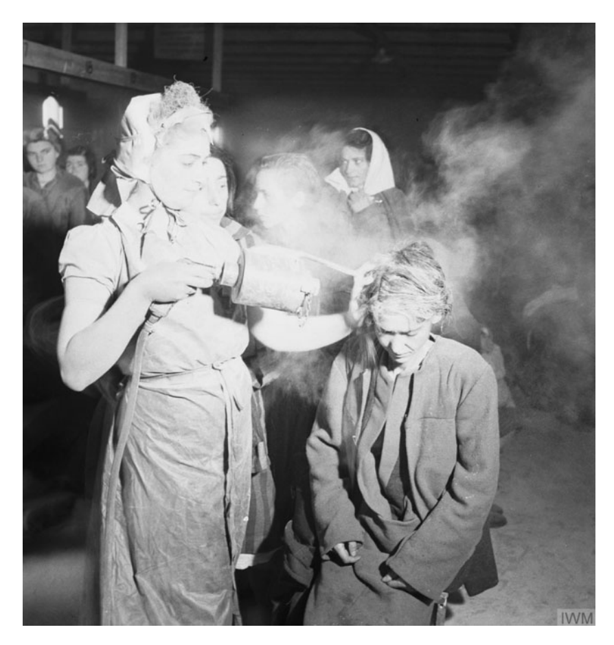
Figure 2. Delousing in Belsen, May 1945. A former inmate being dusted by pneumatic power hose.

As Weindling writes, delousing in such settings was "as much a psychological as a physical torment." The limited ability of Allied liberators to engage in gentle caregiving may also be noted, as it was by the liberators themselves. Among the huts and in the hospital at Bergen-Belsen, for example, British soldiers and relief workers, struggling to provide effective treatment to tens of thousands in need, found that compassion had to be rationed or people would die. "The aim was to deal with them as quickly as possible," one soldier remembered: "every hour that we were dealing with them . . . we knew we were building in a high degree of surgical shock. . . . And the proof of this, of course, was all too obvious by the number of people who died on us."