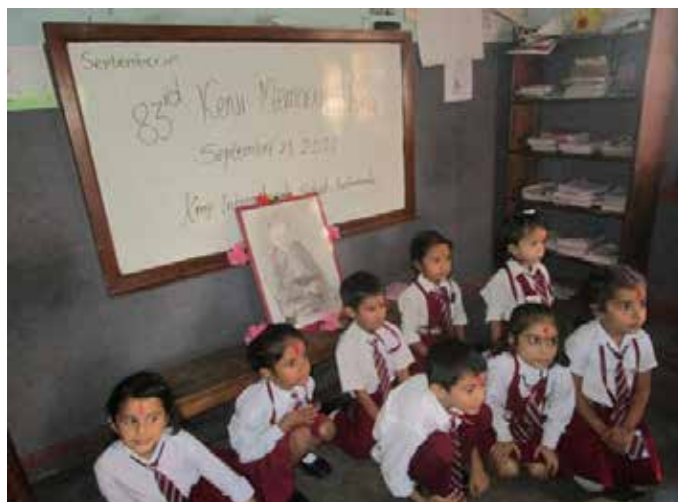
Image 9: Students of Kenji International School celebrating the anniversary of Miyazawa Kenji's birth