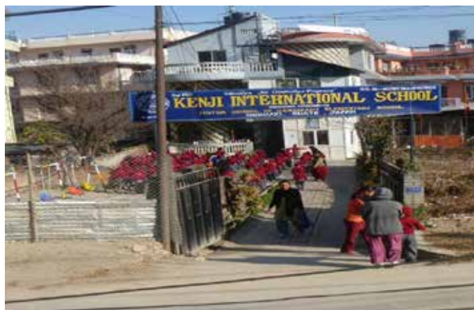
Image 6: Kenji International School taken from the Facebook page of the school.

been very difficult. Yeah, closing the school was a bitter, but ultimately good, experience. It was the right decision.