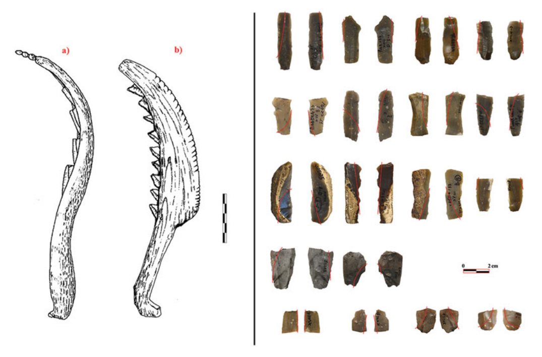
Figure 2. Examples of glossy blades for bended sickles, with: a) antler sickle from Karanovo (modified from Gurova 2014); b) wooden sickle from La Marmotta (modified from Pessina & Tiné 2008).