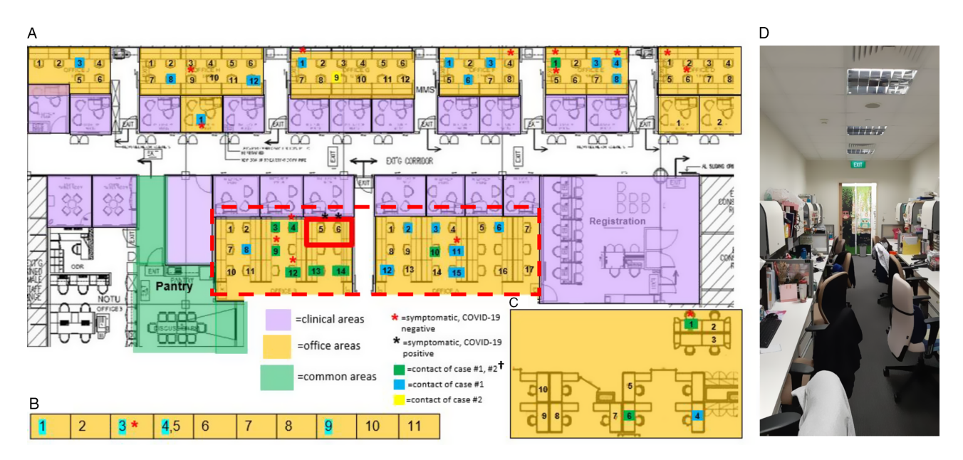
Fig. 2. Distribution of healthcare workers (HCWs) with significant contact history, symptomatic HCWs, and office layout, during detection of a cluster of COVID-19 cases among HCWs. (A) Main medical social services office layout. (B) Series of single-room offices used by senior medical social workers located on the same floor. (C) Off-site medical social services office located in another office tower. (D) Typical layout in main medical social services office at the time of the outbreak. †A total of 49 staff were placed on quarantine (home isolation) based on significant unprotected contact with the 2 cases. Of these 49 staff, 10 had significant unprotected contact with both case 1 and case 2; 23 staff had significant unprotected contact with case 1 only; and 1 had significant unprotected contact with case 2 only. An additional 15 staff did not report significant unprotected contact, but because they shared an enclosed office space with case 1 (dotted line), they were deemed to be at higher risk of exposure and were also placed under quarantine.

Among the 14 HCWs with COVID-19, 4 clusters were linked through epidemiology investigations. Of the 4 clusters, most were likely linked via transmission outside the hospital. One cluster was a family cluster (1 doctor and 1 researcher), and 2 clusters among hospital cleaners consisted of HCWs who shared off-site accommodation (single room with en suite bathroom) but worked in different hospital areas and did not mingle while at work. A cluster of 2 MSWs with COVID-19 and suspected intrahospital spread was detected at the end of week 11 on March 13, 2020, as part of epidemiology investigations. The results of syndromic surveillance and heat maps in the period leading up to the detection of the cluster are shown in Figure 1. The 2 MSWs shared the same office and did not interact with each other outside of work; hence, this constituted a COVID-19 cluster with probable HCW-HCW transmission within the hospital in a non-clinical area.