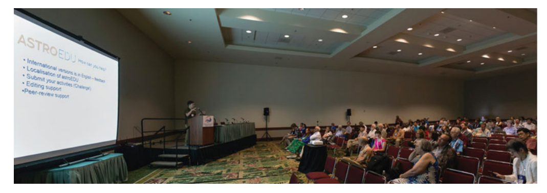
Figure 1. Pedro Russo at the Division C business meeting at the 2015 General Assembly.