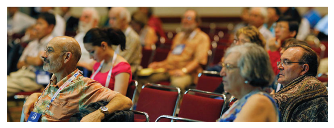
Figure 5. Audience at the Division C meeting at the IAU XXIX General Assembly.