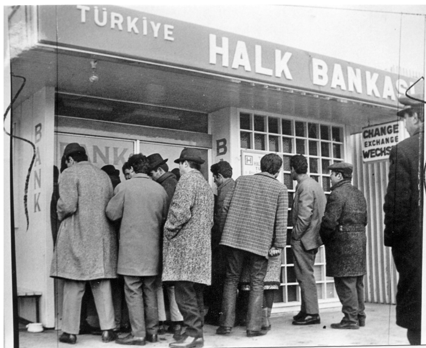
FIGURE 3.2 Guest workers send remittances at Türkiye Halk Bankası, one of the many Turkish banks with branches in West Germany, ca. 1970.