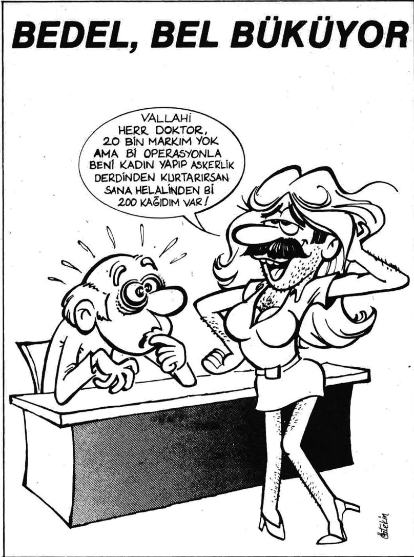
FIGURE 3.5 FEBAG activists published a humorous cartoon in their newsletter, conveying the desperation that young migrants felt when trying to pay their way out of military service, 1984. The caption reads: “By God, Herr Doctor, I don’t have 20,000 marks, but I do have 200 bucks for you if you’ll do an operation to make me a woman and save me from military service.”