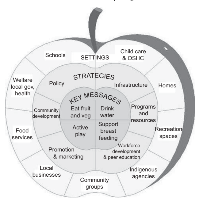
Fig. 1 Key messages, strategies and settings of the eat well be active Community Programs

means that individual behaviours associated with excess weight gain (including healthy eating and physical activity) must be addressed in the context of the environment and the societal and cultural factors relevant to the individual<sup>(6)</sup>.