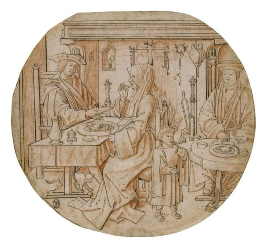
Figure 1. 'Poor parents, wealthy children'. Carton , Leiden, c. 1520–1530. Museum de Lakenhal Collection, inv. no. S 5751

generation had a prospect of eventually being rewarded, while the older generation stayed in control of their possessions and caregivers, since it was possible to modify or withdraw the will. The men and women who are the focus of our paper established strategies to retain agency<sup>2</sup> during old age, either by entering into retirement contracts with the young, or by recording wills.<sup>3</sup> Planning for old age was probably quite common but its traces in the historical record are not always easy to find. To study this subject, we have cast a wide net and investigate a variety of towns in the Low Countries to find out how the elderly could secure support from the younger generation, while at the same time retaining agency. In our discussion, we focus on legal instruments – wills and retirement contracts – and demonstrate how these allowed for dictating future relations with relatives and non-relatives. We also investigate the type of care in old age that was laid down in contracts. Looking at the contractual conditions allows us to see what the elderly deemed important during their final years, and what reasons they could have for rewriting wills and terminating retirement contracts.