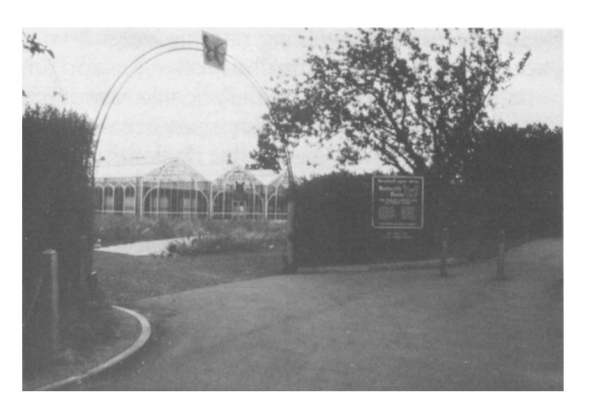
The entrance to Stratford Butterfly Farm, one of Britain's 45 establishments displaying live butterflies (Mark Collins)

The report recommends that butterfly houses should work closely with the Convention on International Trade in Endangered Species of Wild Fauna and Flora (CITES), which is the only international convention affecting trade in butterflies. At the time of the report's publication no butterflies were listed on Appendix I, which prohibits trade, but three families of birdwing butterflies and the apollo butterfly Parnassius apollo were listed on Appendix II, which means they can be traded with permits. The situation was complicated by an EEC Regulation that banned the import of these butterflies into Europe. Since 1984 the IUCN has been trying to change this regulation for birdwings because, although certain of them are among the most threatened species in the world, others are very common, can be reared easily in captivity and are large and beautiful, making them ideal for butterfly houses. If the import of these species were allowed it could help encourage the potential cottage industry in South East Asia, a development that would be welcomed by IUCN. which believes that the rational and sustainable utilization of wildlife should be integrated into conservation programmes. Just about the time the report was published the EEC agreed to allow birdwing imports into Europe. At the July 1987 meeting of CITES in Canada, three swallowtails and Queen Alexandra's birdwing were added to 208