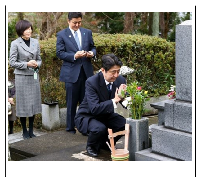
Abe prays before the family grave of Kishi, Dec 22, 2013.

A new era in the political history of postwar Japan has begun, with changes in the Japan-U.S. relationship likely to follow in the years ahead. For even in a land of patrimonial politics Prime Minister Abe is not a typical politician. His economic policies set him apart. So too does his tie to his grandfather Kishi Nobusuke, who was imprisoned after World War II as an unindicted war criminal. Emerging from prison, Kishi launched the first attack from the right on the Tokyo international war crimes tribunal. Later as prime minister, Kishi reshaped Japan's postwar order and in January 1960 renegotiated the one-sided Japan-U.S. security treaty: the military alliance imposed on the occupied nation by the United States, over historically unprecedented popular opposition. Abe agreed with his grandfather's view that relations with the U.S. should be strengthened, and that the postwar constitution needed to be rewritten. He resolved to follow Kishi's lead and prioritize constitutional revision.