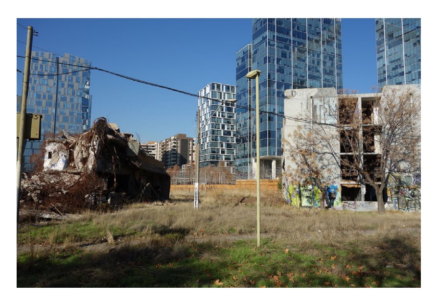
IMAGE 1: The last building from the Villa San Luis, 2019.

homes by the dictatorship of Augusto Pinochet (1973–1990), who came to power in a bloody coup d'état against Allende. Those evictions made way for the development of Nueva Las Condes, the complex that surrounds the ruin. This process exemplifies the kind of accumulation through dispossession that analysts have emphasized as central to processes of neoliberal urban restructuring. In Nueva Las Condes, as in cities throughout the globe, this restructuring has been volatile, if highly profitable. The real estate values of Nueva Las Condes today are among the highest in all of South America.