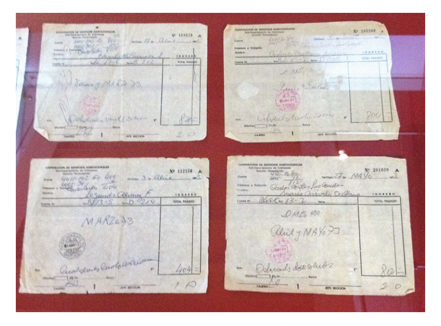
IMAGE 3: Receipts for monthly payments for apartments in the Villa San Luis, Exhibit at the Museum of Memory and Human Rights, 2018.

placate Pinochet, just as the government released the first truth commission into the extra-judicial killings committed by the dictatorship.