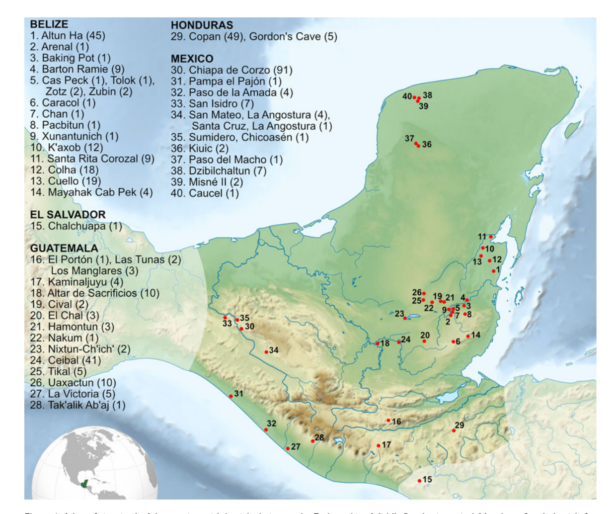
Figure 1. Map of sites in the Maya region with burials dating to the Early and/or Middle Preclassic period. Number of early burials for each site is in parentheses. Map created by Wrobel based on map by Sémhur, https://commons.wikimedia.org/wiki/ File:Maya_civilization_location_map-blank.svg.

relevant trends from adjacent regions when appropriate. For broader reviews of Maya bioarchaeology that include the more extensive mortuary record for the Late Preclassic and subsequent eras, we direct the reader to an excellent recent synthesis by Scherer (2017; see also Spence and White 2009; Wright and White 1996).