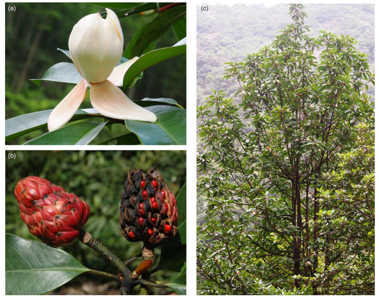
PLATE 1 The flower (a) and fruit (b) of Manglietia longipedunculata, and a mature wild individual (c).