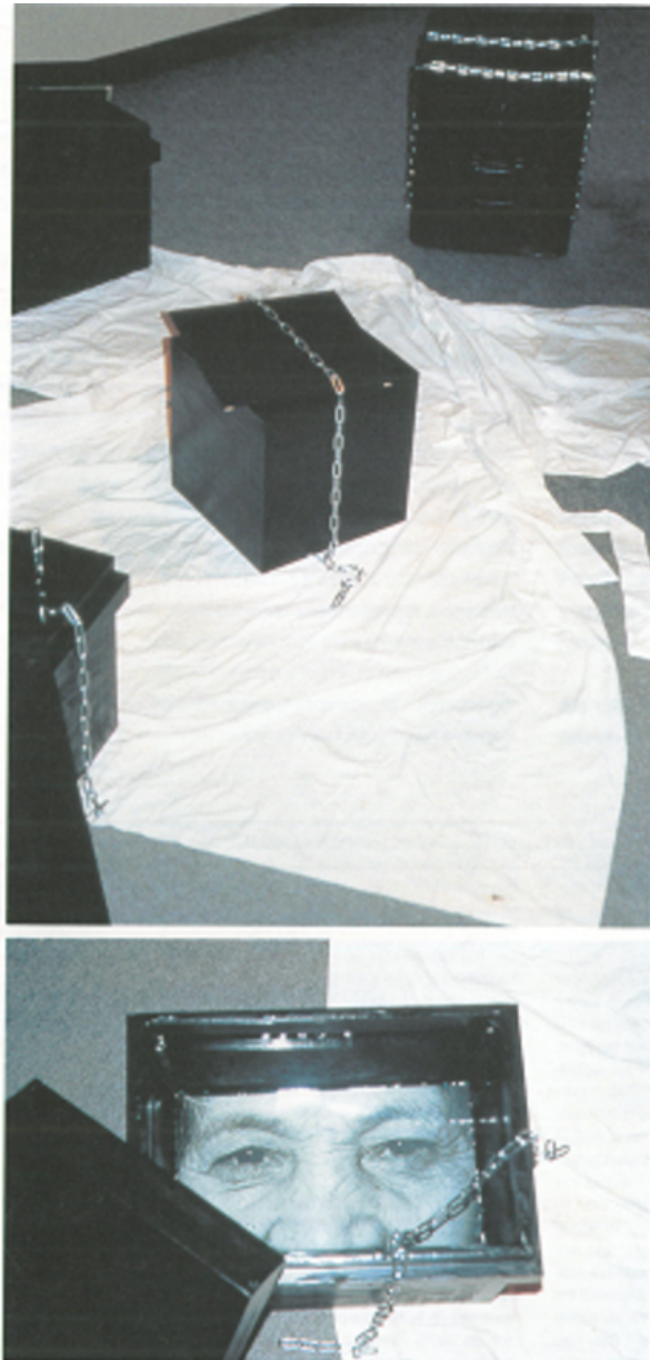
Shimada Yoshiko, image from “Black Boxes + Voice Recorder” 1996

Shimada’s willingness to ask herself “would I have behaved differently?” became more evident in a major exhibit at the Tokyo Metropolitan Museum of Photography in 1996. Shimada’s installation piece, “Black Boxes + Voice Recorder,” featured photographs of former “military comfort women” exhibited in chained black wooden boxes. Placed on the