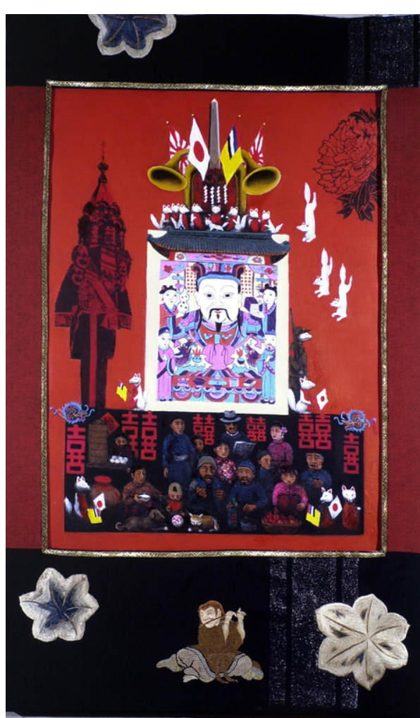
Tomiyama Taeko, Foundation of Manchukuo, painting from "Harbin: Requiem for the 20 th Century," 1995