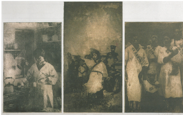
Shimada Yoshiko, "White Aprons" from the series "Past Imperfect" 1992

"Past Imperfect" explored the extent to which Japanese women had participated in and strengthened the war effort—and the costs of that collaboration to themselves, to other Japanese women, and most of all to Asian women. She chose as her symbol for their enthusiasm the white aprons, or kappogi , that wartime Japanese patriotic women's organizations had adopted. Using old photographs of these mothers holding smiling babies, waving flags, and lighting the cigarettes of soldiers, she created collages that commented on their choices. Her critique was made sharper by the border around one of these collages, which incorporated photos of young "military comfort women." As she explained, "I realized that Japanese women were not entirely the voiceless victims of male-dominant militarism. Many were enthusiastic fascists and willing to sacrifice themselves and to victimize others in the name of the emperor." 26 This project emphasized the ways that wartime Japanese women were drawn into the conflict as mothers of soldiers, a form of recognition that simultaneously celebrated them and severely limited their life choices, while also noting that Asian women were assigned far harsher tasks.