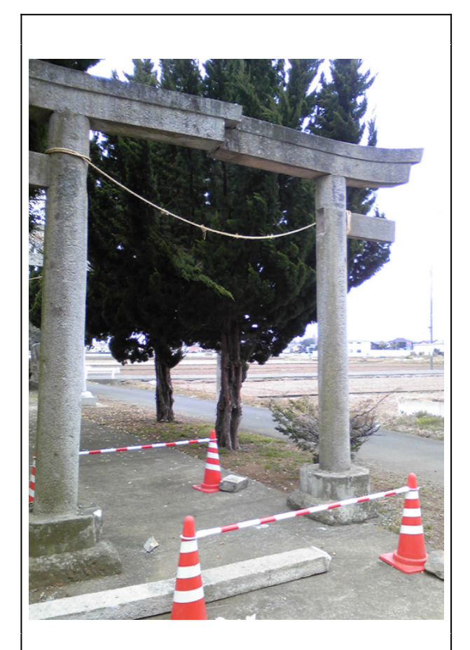
A fractured and dislocated Shrine tori'i gate with the second crossbeam on the ground, Tsukuba, Ibaraki

3/23 Shuzenji, Shizuoka, .0045 MicroSieverts I write this by candlelight. Interesting times.