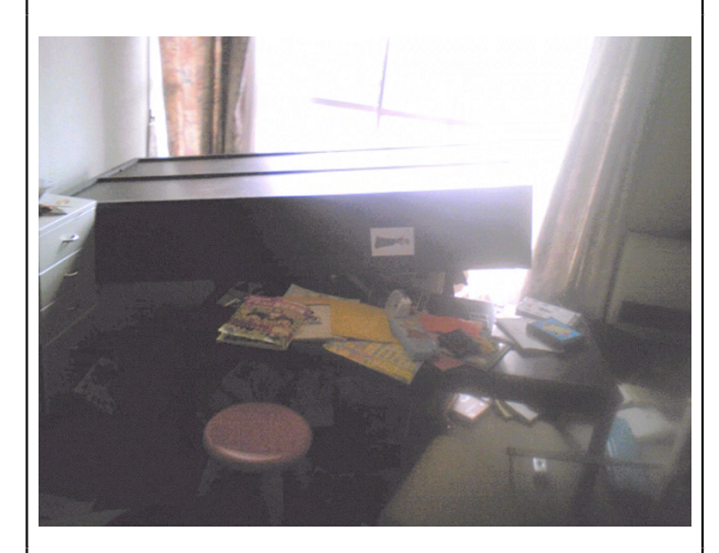
Open china cabinet with broken crockery and glass, fallen bookcase

"Sugoi!" she exclaimed, and so it was. The china cabinet had popped its doors and half the