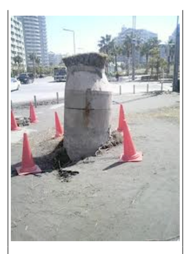
"Manhole Tower", Urayasu, Chiba

And that is not all. Closer to our home, Urayasu City in Chiba is literally sinking. When the quake caused the reclaimed land to settle underneath the pavement, water rushed to the surface and flushed through roads and walkways. There are now "manhole towers", and homes still lack the basic utilities: water, electricity, and cooking gas.