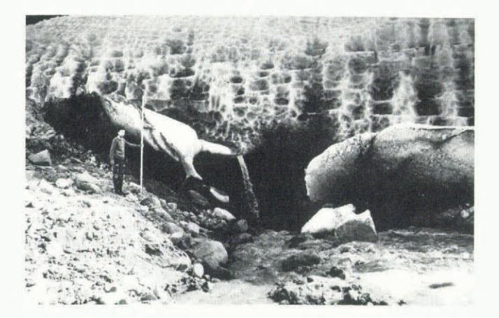
Fig. 4. Close-up of tunnel mouth (surveying staff is 3 m long).

At 21.30 h on 15 July, the lake was observed to be 9.9 m below the previous day's level (Figs 1 and 2a). Water level fell steadily by 2.9 m until midnight when the lake divided into the two smaller sub-basins (Figs 1 and 4). The flow velocity of lake water draining from the upper basin to the more rapidly draining lower basin increased as water