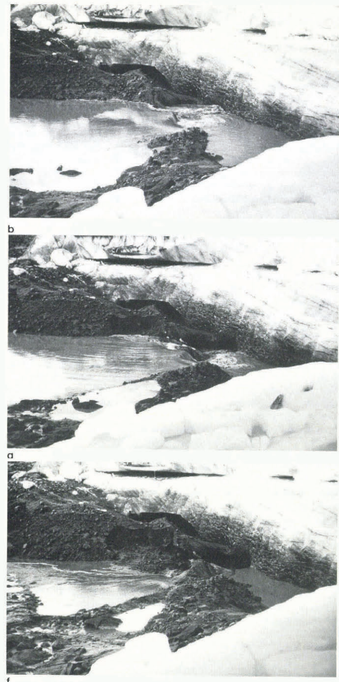
Fig. 3. Photographs taken from nearby moraine ridge (Fig. 2) showing jökulhlaup flows into the tunnel mouth and associated moraine collapse. (a) 00.20 h. whirlpool above tunnel mouth; (b) 00.30 h. tunnel mouth exposed; (c) 00.35 h. back-flow; (d) 00.40 h. initiation of moraine collapse; (e) 00.41 h. continuation of moraine collapse; (f) 00.45 h. moraine collapse exposed.

this moraine ridge and direct drainage from the upper to the lower lake basin (Figs 1 and 2b).