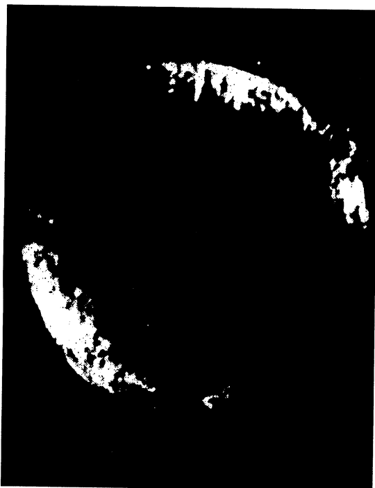
Fig. 2. Radio image of the remnant of SN1006. It appears as a ring, but in three-dimensional perspective it more nearly resembles a shell. This image, obtained through the courtesy of Professor Stephen P. Reynolds, was made with the Very Large Array of the National Radio Astronomy Observatory operated by Associated Universities, Inc., under cooperative agreement with the National Science Foundation. The three points of light are common background extragalactic radio sources (Reynolds and Gilmore 1986).

Its light illuminated the horizon and it twinkled a great deal. It was a little more than a quarter of the brightness of the Moon" (Murdin 1985: 15). The radio remnant of SN1006 is shown in Figure 2.