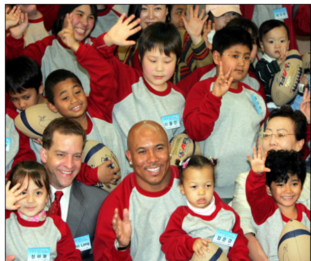
Bi-ethnic and bi-racial children in Seoul

addition, the number of bi-ethnic/bi-racial children in elementary and secondary school reached 13,445 in 2007, up 68.1 per cent from the previous year (7,998). The proportion of bi-ethnic/bi-racial children in total enrollment is expected to rise to 16 per cent in 2118 and to more than 870,000 or 26 per cent in 2050. Elementary textbooks will soon include a section on bi-ethnic/bi-racial children and multicultural families, highlighting the need to understand their cultural backgrounds and to develop more tolerant attitudes toward them. This is a major change from the emphasis on ethnic homogeneity, which presented Korea as a consanguineous community comprised of the descendants of one common ancestor. Major television networks have started to program shows featuring immigrant brides and multicultural families. Evidently, Korean society is starting to implement measures to accept the multicultural reality, at least for those who share “Korean blood.”