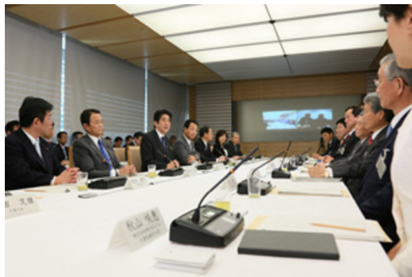
The Abe cabinet discusses growth strategy

and underpay and poor career possibilities for non-regulars, who get less respect and may receive less than a living wage for a nearly 40-hour workweek. The relative poverty of the working poor is linked to delays in marriage and consequent birthrate declines. This growing imbalance in (and between) the lives of regular “core” and non-regular “peripheral” workers is starting to threaten social reproduction and Japan’s long-term social stability.