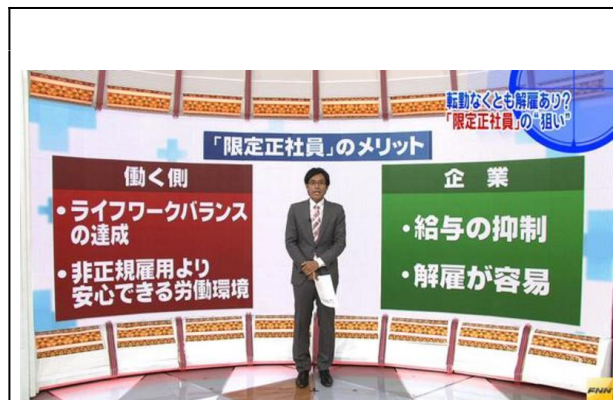
A television news show presents the conflicting aims of limited regular employment for labor and capital. For workers: achievement of work-life balance and more reliable labor environment than non-regular employment. For companies: ability to hold down wage costs and dismiss workers more easily.