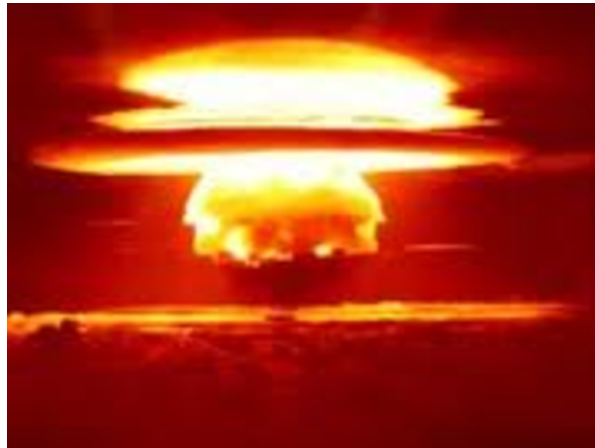
The Bikini blast

The ocean at night, dyed the colors of sunset, then the rumbling, and—two hours later—the white ash falling: I felt as if I had experienced it along with that young man and wanted to visit him in the hospital and hear from him firsthand. But when I boarded the train, I became absorbed in that persimmon-bound book.