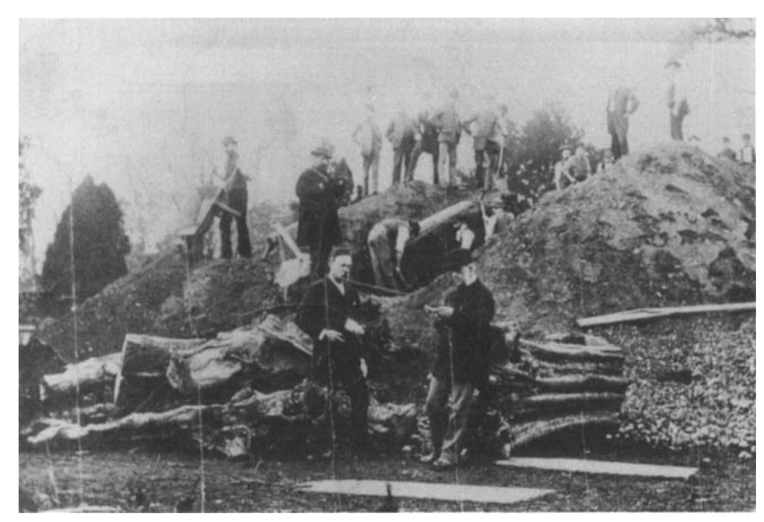
FIGURE 1. The excavation of the burial mound in the churchyard of Taplow, Buckinghamshire, in 1882.