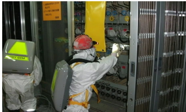
Workers at the Fukushima Daiichi nuclear power plant check water levels at the No 1 reactor.