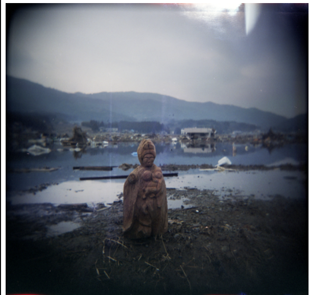
The earthquake and tsunami did extensive damage to large areas of Tohoku.