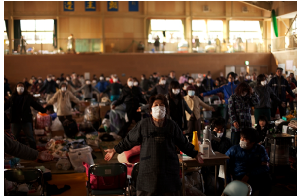
The Great Tohoku earthquake forced many to evacuate their homes and live in shelters.

“The pipes, which regulate the heat of the reactor and carry coolant are the veins and arteries of a nuclear power plant; the core is the heart. If the pipes burst, vital components don’t reach the heart and thus you have a heart attack, in nuclear terms: meltdown. In simpler terms, you can’t cool a reactor core if the pipes carrying the coolant and regulating the heat rupture—it doesn’t get to the core.”