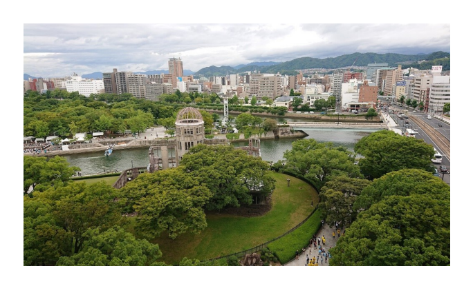
A view of the A-bomb Dome in the Hiroshima Peace Memorial Park from the

After all, it was the idea of peace that connected "ruins" and "reconstruction." The notion of peace exerted the magic-like power mentioned earlier, and became a driving force for gaining governmental support. Support for "ruins preservation theories" that called for preservation of the hypocentre as a symbol of peace quickly lost support with the emergence of the call for city development in the name of peace. Here, "peace" and "development" merged without contradiction.