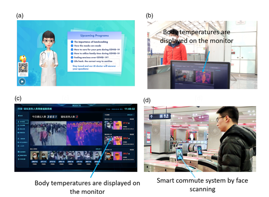
Figure 3. (a) AI doctor from SenseTime to provide personal hygiene advice on a live-streaming video platform.<sup>40</sup> AI powered screening system from (b) SenseTime<sup>41</sup> and (c) Megvii.<sup>42</sup> (d) SenseMeteor Smart Commute system from SenseTime.<sup>43</sup>

versions of the health code; however, this caused issues for travelling because not all cities recognized each other's QR codes.<sup>50</sup> In some provinces, the health codes have been removed already, but in others the codes govern where people can go.<sup>50</sup>