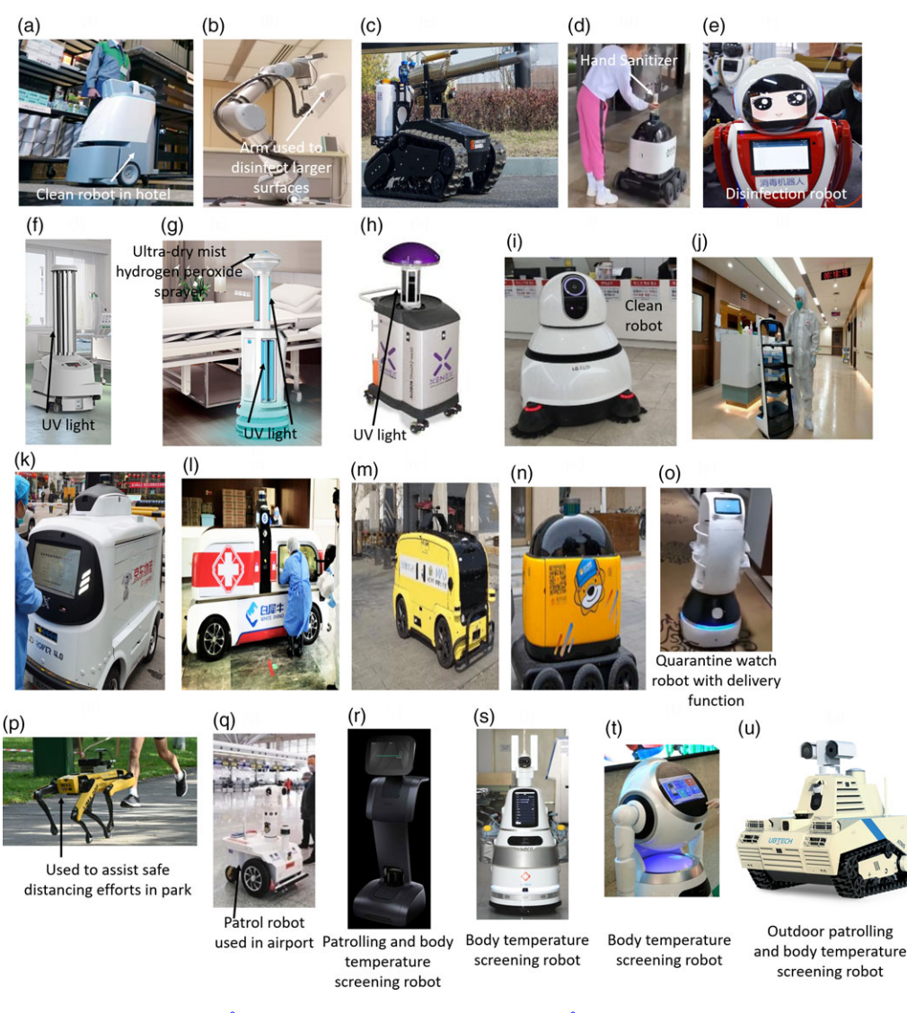
Figure 2. (a) Cleaning Robot from SoftBank Robotics.<sup>8</sup> (b) XDBot by Nanyang Technological University.<sup>9</sup> (c) Tank-style, remote-controlled disinfecting robot.<sup>10</sup> (d) Portable hand sanitizer robot from Zhen Rhobotics Corp.<sup>11</sup> (e) Aerosol Disinfection Robot from Shanghai TMiRob Technology.<sup>12</sup> (f) UV-C light Disinfection Robot by UVD Robots.<sup>13</sup> (g) Intelligent Disinfection Robot by TMiRob.<sup>14</sup> (h) UV light robot by Xenex Disinfection Services.<sup>15</sup> (i) Autonomous Cleaning Robot by Seoul National University Hospital.<sup>16</sup> (j) Pudu Technology's autonomous service delivery robot.<sup>18</sup> (k) JD Logistics' large self-driving delivery vehicle.<sup>19</sup> (l) White Rhino Auto Company's large self-driving delivery vehicle.<sup>20</sup> (m) Meituan's large self-driving delivery vehicle.<sup>21</sup> (n) ZhenRobotics' RoboPony.<sup>22</sup> (o) Quarantine watch robot.<sup>23</sup> (p) Boston Dynamics' Spot being used in Bishan-Ang Mo Kio Park, Singapore.<sup>24</sup> (q) Smart patrol robot being used in Guiyang Airport, China.<sup>25</sup> (r) Temi robots,<sup>26</sup> (s) AIMBOT, and (t) Cruzr robots from UBTech.<sup>28</sup> (u) Atris outdoor screening and patrolling robot from UBTech.<sup>30</sup>