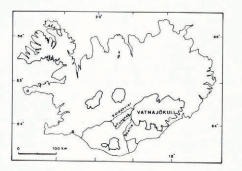
Fig.1. Location map of ice caps and the main river systems from western Vatnajökull.

The glacier surface elevation and the bedrock topography of western Vatnajökull has been mapped in detail by radio echo-soundings (Björnsson, in press). The accurate surface-elevation maps allow delineation of the individual ice catchment basins, on a regional scale. The bedrock maps make possible studies of the influence of bedrock topography on the drainage of the melt water that enters the glacier bed through moulins, crevasses, and veins, as well as basal meltwater, produced by frictional and geothermal heat. The delineation of the watersheds on ice caps, which drain melt water to many rivers, is an important topic of applied glaciology in Iceland. The paper considers the drainage basins for three rivers which drain western Vatnajökull: Tungnaá, Sylgja and Kaldakvisl (Fig.1).