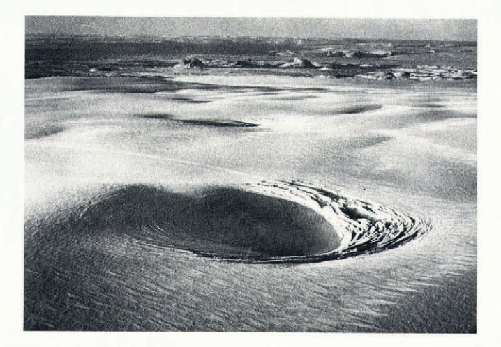
Fig.3. An ice cauldron 10 km NW of Grimsvötn, Vatnajökull, Iceland. Diameter: 3 km. Maximum depth: 150 m. Photograph: Helgi Björnsson, 8th January 1982, at the end of a jökulhlaup in the river Skaftá.

The outlets Tungnaárjökull and Skaftárjökull (named after the rivers) are separated by an ice divide which lies to the NE of Tungnaárjökull and terminates SW of a catchment basin which drains ice towards an ice cauldron, an almost circular depression in the ice surface (Fig.3). The ice cauldron is situated above a subglacial, geothermal area,