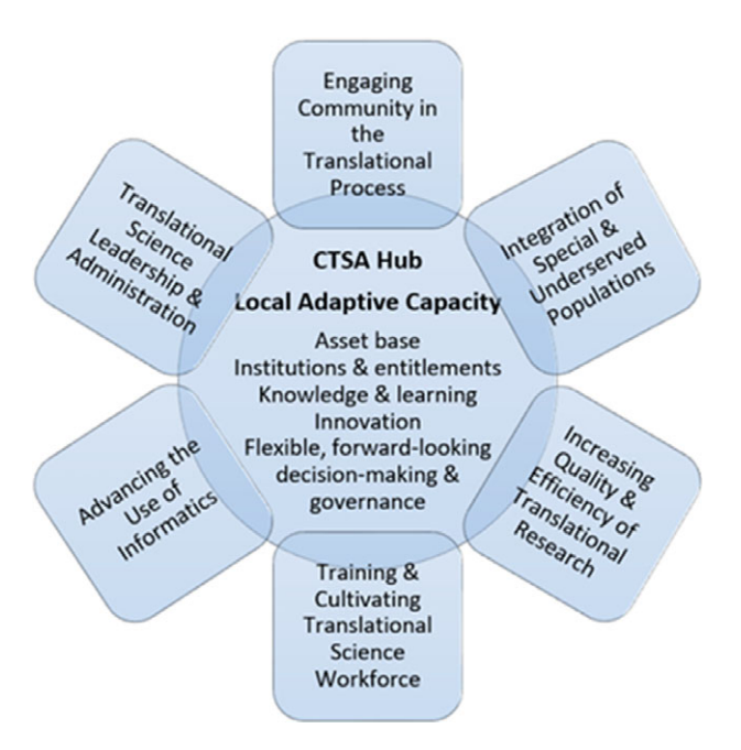
Fig. 2. Local adaptive capacity of CTSA hubs.

featuring relevant highlights, accomplishments, challenges, metrics, etc.