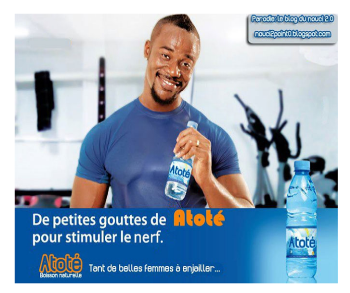
Figure 4. E-commerce advertisement for Atoté Boisson naturelle ["natural drink"]. Slogan: " De petites gouttes de Atoté pour stimuler le nerf. Tant de belles femmes à enjailler... " ["Little drops of atoté to stimulate the nerve/muscle: So many beautiful women to enjoy..."] (my translation). Screenshot from Nouchi2.0, March 2017.

stimulant resides in the name on the bottle and the tagline: Boisson naturelle , " De petites gouttes de Atoté pour stimuler le nerf. Tant de belles femmes à enjailler... (Natural drink: Little drops of atoté to stimulate the nerve: So many beautiful women to enjoy...[my translation])". "Stimuler le nerf (stimulate the nerve)" alludes in sophisticated ways to an erection. That sophistication is elided by the unequivocal tagline "so many beautiful women to enjoy," which privileges male pleasure and identifies women as the objects of male desire and satisfaction.