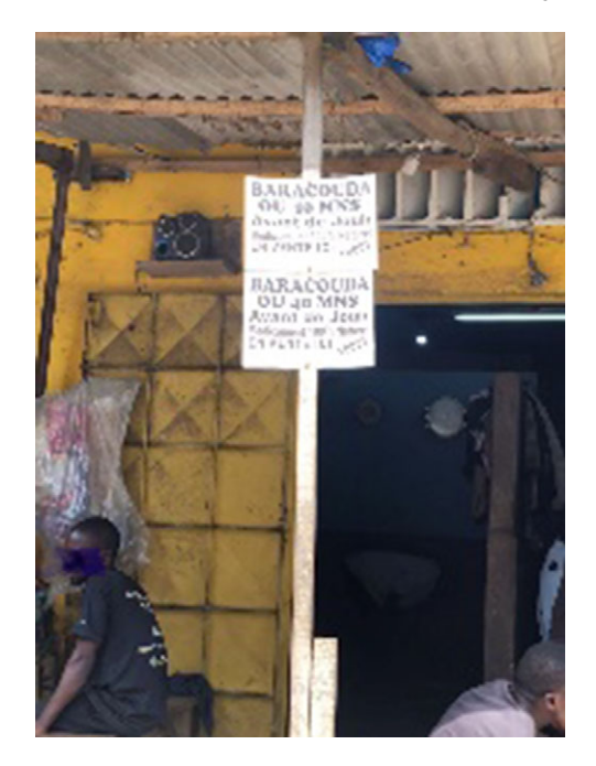
Figure 2. Flyer advertising Baracouda or 40mns to Orgasm in the market. Abobo, Abidjan, Côte d'Ivoire, December 20, 2021.

The name "Baracouda ou 40mns avant de jouir," with the alternative connector "ou" ("or"), is unequivocal in its specificity. Taken in the context of the popular market of Abobo, the flyer (see Figure 2) appears in an unlikely place. The store that offers dry goods such as rice, millet, and beans is staffed by men from either the Malinké/Dioula group of Mali, Guinea, and northern Côte d'Ivoire, or the Hausa group of Nigeria and Niger. Not surprisingly, given the conventional understanding of these individuals as publicly restrained in matters of sexuality, I did not expect such a place to serve as the advertising spot for a sexual enhancement product. I spotted the same flyers in other neighborhoods. Explicit in its message and crude in its design, the poster features no picture or colors (other than black and white) that may offend some sellers as well as buyers. The crudeness of the design may reflect the seller's intended goal, thus indicating sophistication (as she knows her audience), or lack of resources for a more colorful ad. "Baracouda" in the appellation of the product is a nod to the widely known American actor Mr. T, who remains in Abidjan and perhaps elsewhere the epitome of traditional masculinity, with his bulging muscles, threatening facial expressions, and an intimidating physical and emotional makeup.