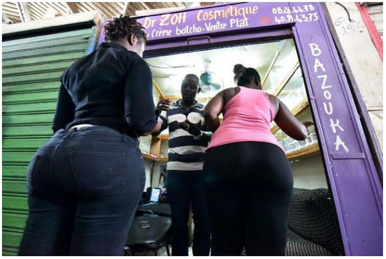
Des grosses fesses, Abidjan, Côte d'Ivoire

Figure 5. Dr. Zoh Cosmetique store in the Belleville market. Treichville, Abidjan. Côte d'Ivoire, March 2017.