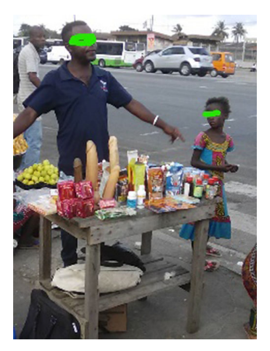
Figure 3. Man selling male aphrodisiacs and a captivated prepubescent girl. Grand Carrefour, Koumassi, Abidjan. Côte d'Ivoire, September 2020.

As suggested earlier, the logic of branding and advertising extends to images on packaging that often feature penises of an unlikely large dimension and prominent female buttocks in various states of positioning and covering. In some settings, however, sexual objects, namely dildoes, become advertising strategies, as with the stand of a seller of male aphrodisiacs at the Grand-Carrefour of Koumassi, a busy location (see Figure 3). During the three years (2019 to 2021) that I followed this retailer, unconventionally large black and white dildoes have been the markers of his wares. I have never interacted with him directly for methodological reasons; the choice of leaving out the actors' formulations of their intentions overlaps with my focus on the visual.