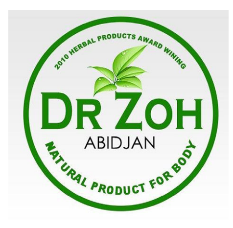
Figure 6. Dr. Zoh's logo. Screenshot from Facebook.com, January 2022. Credit: Facebook.com

the Ivorian board of physicians to hold the merchants to account. The report's criticisms were about packaging, dubious brand names, and unproven claims about the products' efficacy, as well a lack of information on their possible unwanted side effects. Albeit cogent, these criticisms stayed within a negative logic with the use of qualifiers such as reckless. Indeed, framing the design of the packaging as uniquely risky and nothing else (such as, for instance, sophisticated) strengthens the disabling narrative about the hypervisibility of sexual images and scenes, a trend that this essay seeks to complicate.