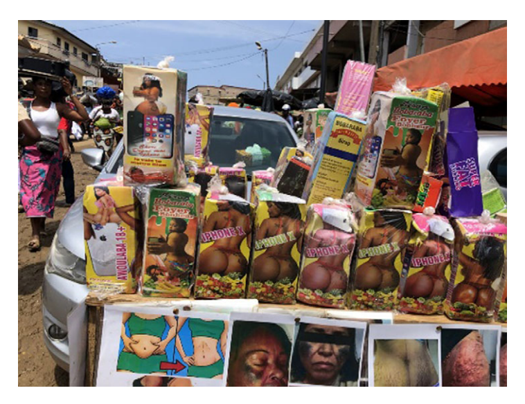
Figure 1. A market stand of iPhones, buttocks-enlarging syrups, and healing products. Adjamé market, Abidjan, Côte d'Ivoire, July 25, 2021.

The latest name in buttocks- and breast-enhancing products is iPhone X, which builds on the popularity and the upscale nature of the Apple brand. This stand (see Figure 1) in the popular market of the commune of