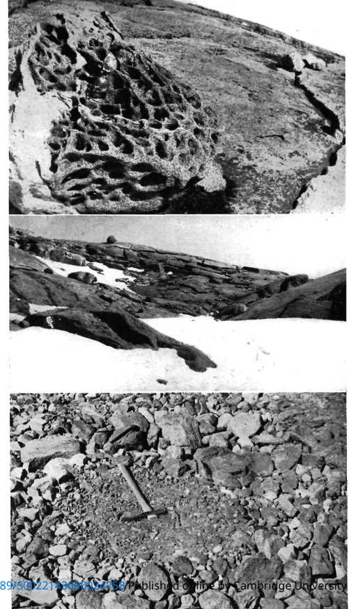
Fig. 5. Cellular deflation of a boulder and desquamation of rocks