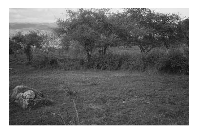
Plate 2 Agricultural habitat in the Dokhtawady River floodplain below Myaleik Taung. Star tortoises frequently utilize small hedgerows between fields as cover.

Forest Department recently proposed the designation of 3,240 ha of Myaleik Taung as the Myaleik Taung (Kwenahpa Taung) National Star Tortoise Sanctuary. The Dokhtawady River Valley below Myaleik Taung was settled in the early 1970s and is now densely populated. The composition of the original vegetation is somewhat speculative, but British military maps dating from World War II label the Dokhtawady Valley as "dense jungle, mainly bamboo" (Sheets 93 C1 and C5 issued by Survey Headquarters, Burma Command, November 1944), and Searle (1928) describes this area as "Bamboo Forest". The river valley has since been converted to agricultural fields, and cultivation extends to the base of Myaleik Taung. Cotton, corn, and beans are the principal crops, and livestock graze in fallow fields. Agricultural fields are separated by narrow hedgerows of bamboo and thorn scrub (Plate 2), and small clumps of brush are scattered throughout, especially on rocky patches that cannot be tilled.