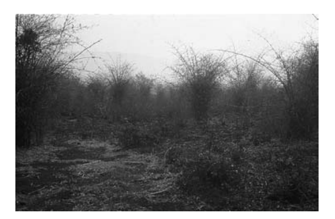
Plate 1 Bamboo brake at the base of Myaleik Taung. This photograph was taken during March 2001 at the height of the annual dry season. Note the lack of foliage and ground cover.

Forest Department recently proposed the designation of 3,240 ha of Myaleik Taung as the Myaleik Taung (Kwenahpa Taung) National Star Tortoise Sanctuary. The Dokhtawady River Valley below Myaleik Taung was settled in the early 1970s and is now densely populated. The composition of the original vegetation is somewhat speculative, but British military maps dating from World War II label the Dokhtawady Valley as "dense jungle, mainly bamboo" (Sheets 93 C1 and C5 issued by Survey Headquarters, Burma Command, November 1944), and Searle (1928) describes this area as "Bamboo Forest". The river valley has since been converted to agricultural fields, and cultivation extends to the base of Myaleik Taung. Cotton, corn, and beans are the principal crops, and livestock graze in fallow fields. Agricultural fields are separated by narrow hedgerows of bamboo and thorn scrub (Plate 2), and small clumps of brush are scattered throughout, especially on rocky patches that cannot be tilled.