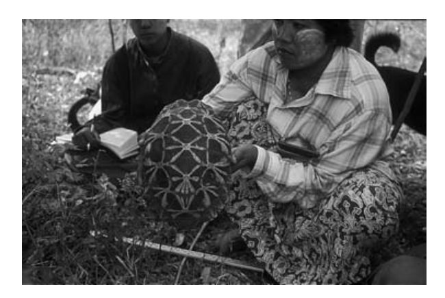
Plate 3 Female star tortoise captured in a fallow cotton field near the base of Myaleik Taung during March 2001. This was the largest star tortoise (carapace length = 27.8 cm) found in two years of fieldwork.

contrast, large tortoises were frequently encountered at Myaleik Taung indicating that exploitation has been minimal.