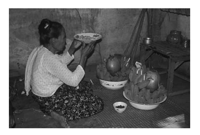
Plate 4 Shamaness at Myaleik Taung making an offering to supernatural beings known as nats prior to initiating our field survey. Villagers believe that tortoises are protected by nats inhabiting the mountain, and would not assist us until this ceremony was performed.

While there are probably as yet unidentified populations of G. platynota elsewhere in central Myanmar, those in Minzontaung Wildlife Sanctuary and Myaleik Taung are the only viable populations currently known and therefore of global conservation significance. Because local religious beliefs afford a high degree of protection and commercial poaching is so far non-existent both sites offer excellent prospects for star tortoise conservation. Although these areas are relatively