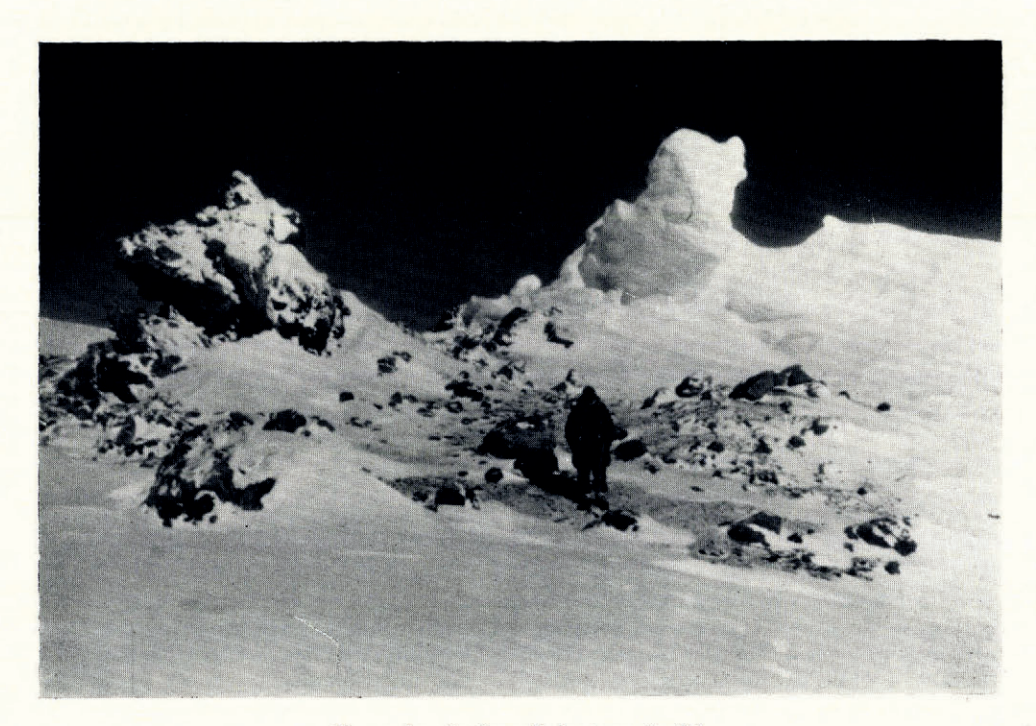
Fig. 1. Inactive fumarolic ice towers (1962)

Although the two parties took different routes, both traversed the extensive area of active and inactive fumaroles at 3,500 m. elevation on the north-west side of the mountain. The fumarole areas offer an unusual spectacle of large ice towers and mounds (Fig. 1). The towers vary in size but they are commonly 6 to 10 m. high and 3 or 4 m. or more in diameter. An aerial view (Fig. 2) shows that some towers have a roughly circular aperture in the crest. Many of the fumaroles were not active during 1962 and 1964, which is in contrast to the situation during the 1908 ascent (David and Priestley, 1914, p. 208–17), but in 1962 a few vents close to the ground were emitting gases. The ice towers are clearly formed by the