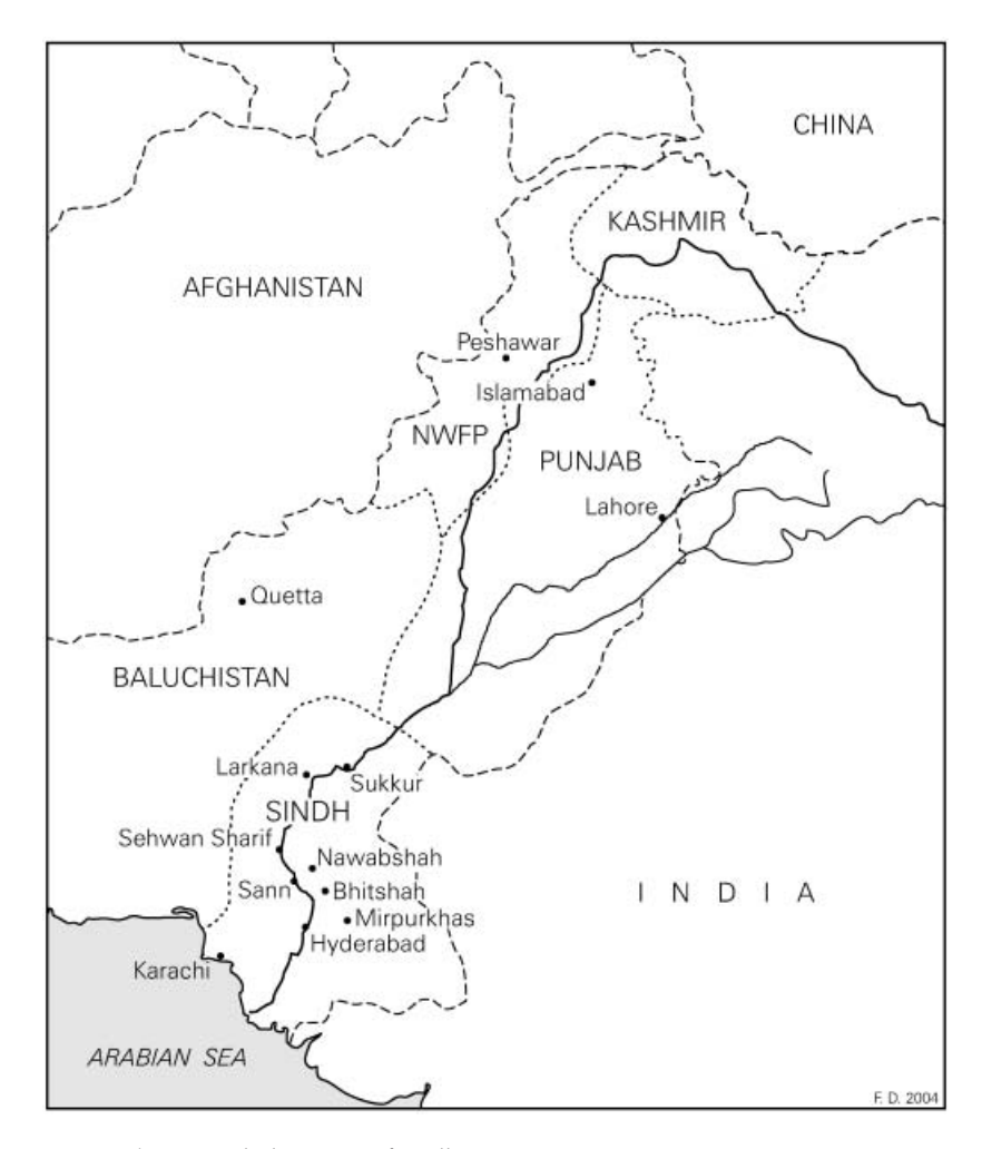
Figure 1. Pakistan, with the region of Sindh.

differ from tradition. This contribution focuses on these two intellectuals, the peculiar form of Islamic reform they developed, as well as the context in which they operated.