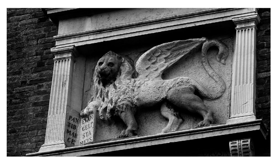
Figure 1. Lion of St Mark. Botticino stone, Crema, Palazzo Pretorio (formerly at Porta Ripalta), 1490.

their function as political or religious symbols. 46 However, political participation was not only expressed through the offence and defence of sculptures or images. In some cases, statues could materially epitomize the people's many voices. The well-known 'talking statues' or 'speaking sculptures', for example, were positioned in cities' busiest public locations and represented intermedia cultural objects, involving – thanks to the pasquinades posted on them – written, architectural, oral and visual forms of political communication. 47 These statues, and other objects discussed below, embodied the intermediality of early modern political interactions and acted as urban nodes of complex communication networks. 48 In Venice, for instance, the marble statue of the Gobbo and the low column which stands beside it (the pietra del bando ) were simultaneously an example of intermedia functionality and of the multiple meanings of public spaces. Located in the campo San Giacomo near the Rialto bridge, this architectural element was used by town criers for making their announcements or by street singers working the busy market area for their aural performances, while