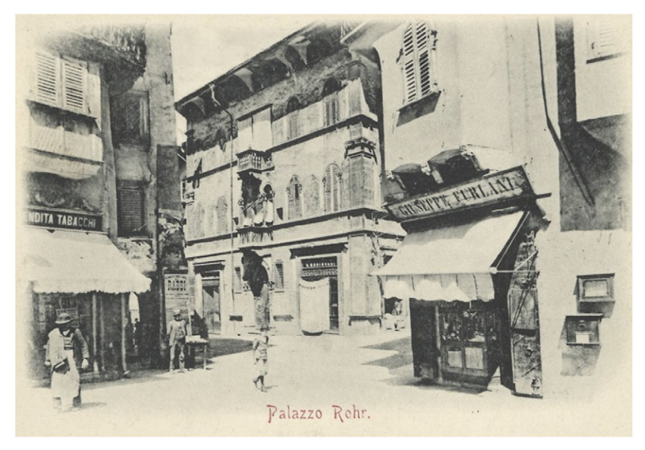
Figure 5. Stengel & Co., View of the 'Canton' in Trento. Photo, Biblioteca Comunale di Trento, n. TIC511–1475, 1897.

criers; they were also 'nodes in the networks of urban community', multifunctional spaces shared by locals and foreigners of various social classes in order to gather and discuss news, and to exchange gossip or ideas.<sup>79</sup> Moreover, the Canton was the site where political statements might be anonymously posted on the walls, sometimes attacking the ruling elites. Examples of this practice were the scandalous broadsheets criticizing local magistrates that were fixed to a column in the city's main square (Piazza del Duomo) and at the Canton in May 1545, just a few months before the great opening of Council of Trent.<sup>80</sup> The function of the Canton as a public political space persisted well into the twentieth century, when posters on the column at the street corner and newspaper vendors could still be seen in the same location (see Figure 5).