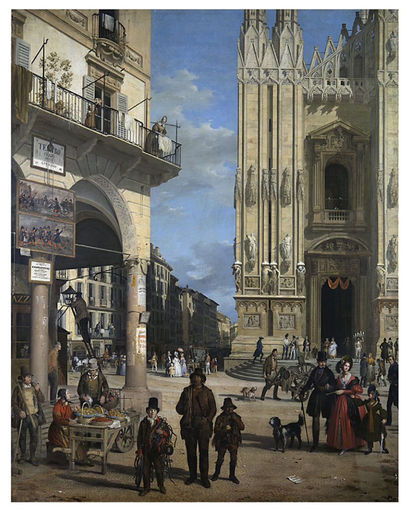
Figure 4. Angelo Inganni, View of the Piazza del Duomo with the Loggia dei Figini , 1838. Oil on canvas, Milano, Palazzo Morando – Costume Moda Immagine, inv. 832.

example, Girolamo Priuli noted how in various Italian cities, Venice's political adversaries launched a polemical offensive against the Republic, targeting public spaces such as piazzas, barbershops and brothels, where people gathered to get up to speed on the latest political news.<sup>72</sup> In his well-known encyclopaedia of professions, Piazza universale di tutte le professioni del mondo (1585), Tomaso Garzoni stigmatized those people who 'spend all of their time strolling in the square, going from the taverns to the fishmongers and from the palace to the loggia, doing nothing else all day but wandering here and there, now hearing singing among the stalls...now