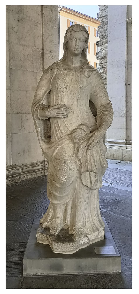
Figure 2. Unknown artist, Lodovica della Loggia . Botticino stone, Brescia, Piazza della Loggia, second half of the sixteenth century.

paint satirical verses.<sup>55</sup> After the marble lion was removed from the main public space, this mutilated and 'talking' sculpture disappeared, and the social life of this political object ended there.